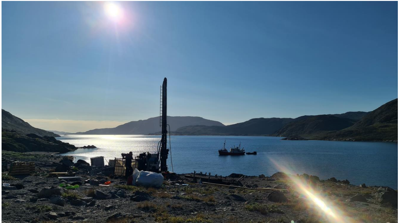
Photo 1. Drill rig commences operations at the Tanbreez Project in Greenland.