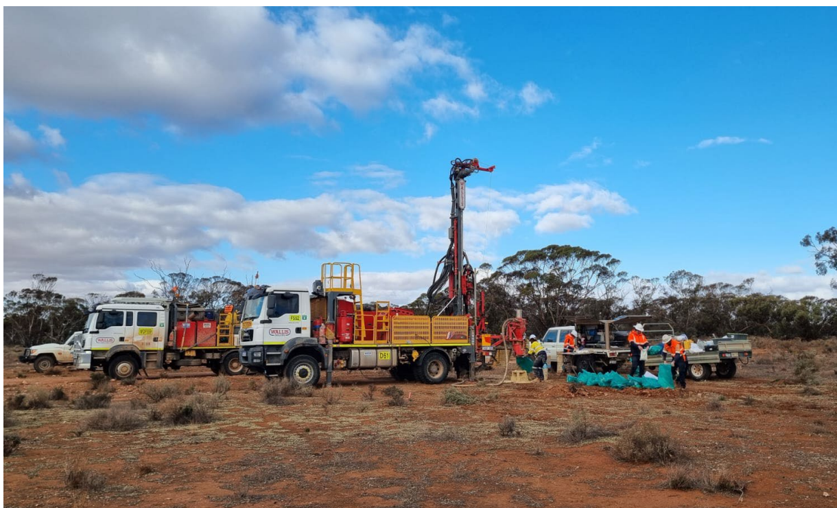
Figure 1: Air Core drilling at EL6895.

The current drilling program is expected to run from July to October 2025 with the initial follow-up of surficial calcrete and roll-front targets, followed by systematic testing of high-priority targets across the extensive tenure position. AR3's total project area now encompasses approximately 7,700km 2 of land in a frontier uranium play in South Australia's Murray Basin (Figure 2).