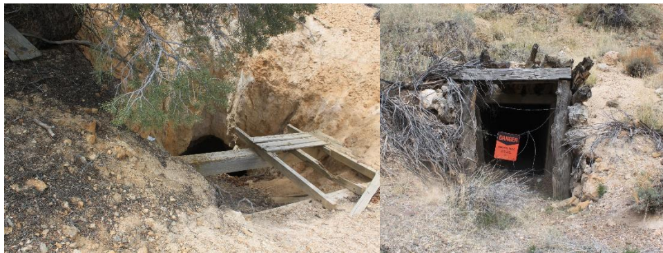
Figure 1: Shaft and Adit Within Excelsior Gold Project, Nevada

Mapping and sampling of each of the respective targets will be undertaken in order to further rank priorities and define the basis for RC drill testing. The targets identified have the potential to significantly expand the overall scale of mineralisation at the Project.