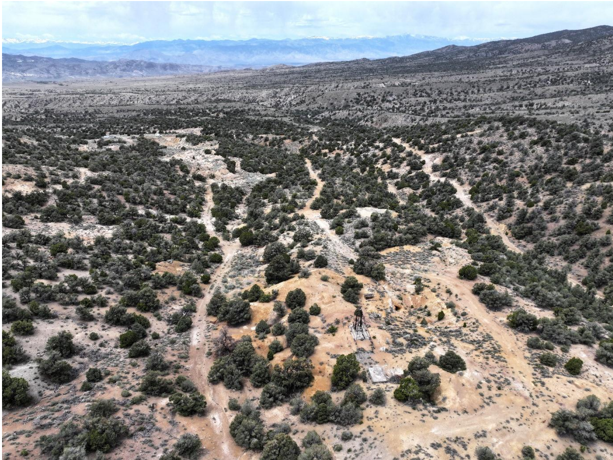
Figure 2: Buster Mine Trend

Recent rock chip sampling towards the eastern extent of the Excelsior Springs Project area on a parallel structural trend supports a wider precious metal opportunity around the Blue Dick Mine, with recent field mapping and sampling returning results of up to 6,630g/t Ag (Silver) from an area which is yet to be drill tested 1 .