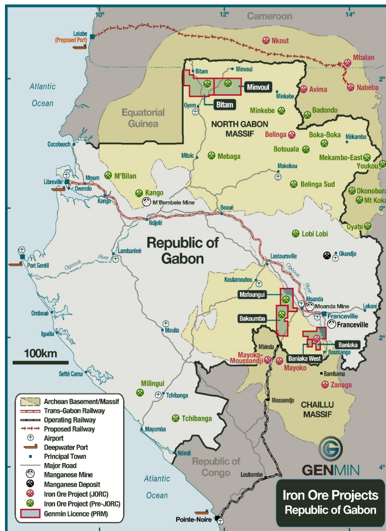
Figure 1: Genmin's iron ore project locations, Gabon

The North Gabon Massif extends to the North into Cameroon and the Republic of Congo and hosts several significant iron ore deposits. The Chaillu Massif extends to the South into the Republic of Congo and hosts the Mayoko and Zanaga iron ore deposits and the Company's Baniaka Project (Figure 2).