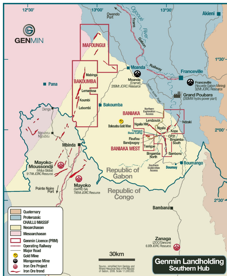
Figure 2: Genmin project location, southeast Gabon

On 11 March 2020, The World Health Organization announced that the coronavirus disease (COVID-19) had become a Pandemic, which has resulted in global travel restrictions and the isolation of populations. The duration of the Pandemic has been long running and at the date of this Report it is unlikely that the Company can implement and complete its full work plan for 2020. The Company will continue to monitor the extent and impact of COVID-19 on its activities and operations.