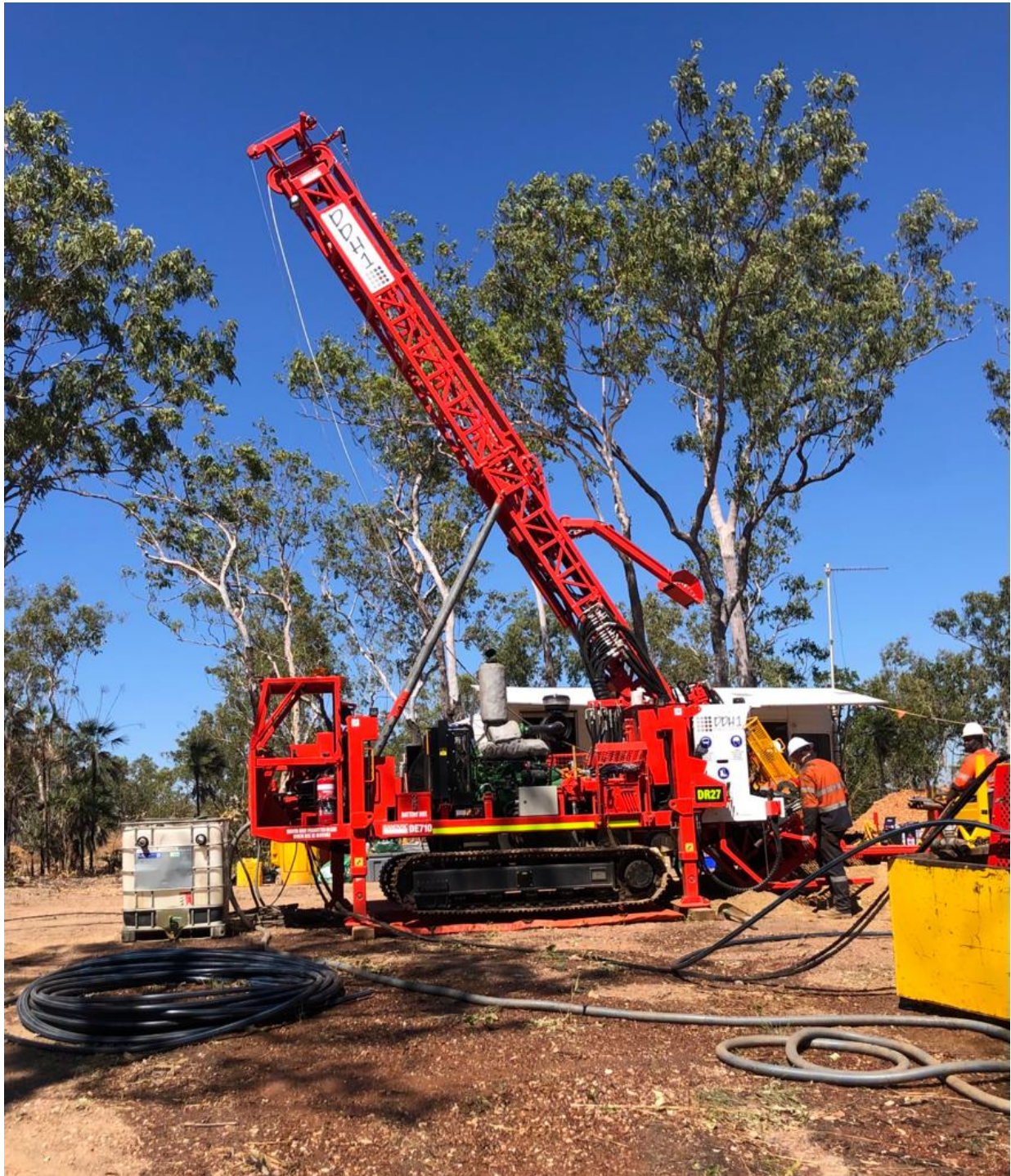
Figure 1: DDH1 diamond drill rig in operation at the Lei Prospect.

Infill and extensional diamond drilling commenced at the Lei Prospect, with 2,000m of diamond drilling scheduled to target an extension in depth and along strike of both Lei pegmatites (refer, Figure 2). A portion of the program at Lei includes resource definition drilling, with initial results expected to be returned within 4-6 weeks.