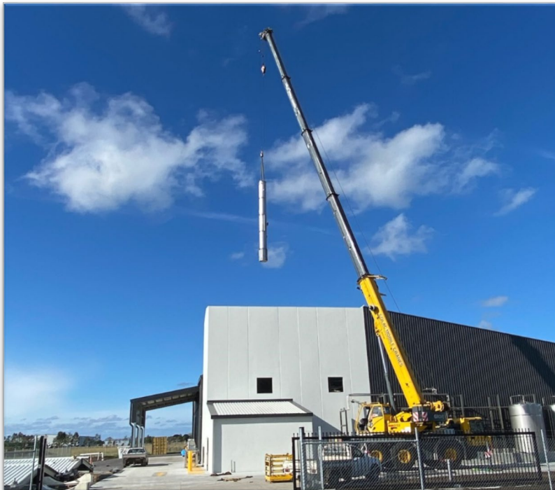
Image: Crane lifting evaporator into building