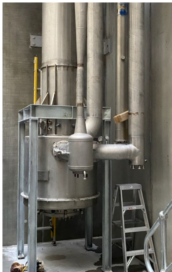
Image: Piping and services