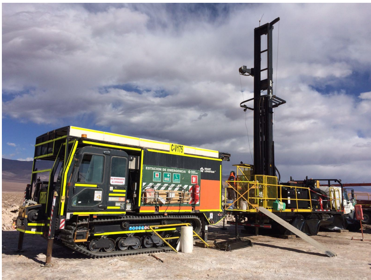
Figure 2: Sonic drill rig onsite at Maricunga lithium brine project.