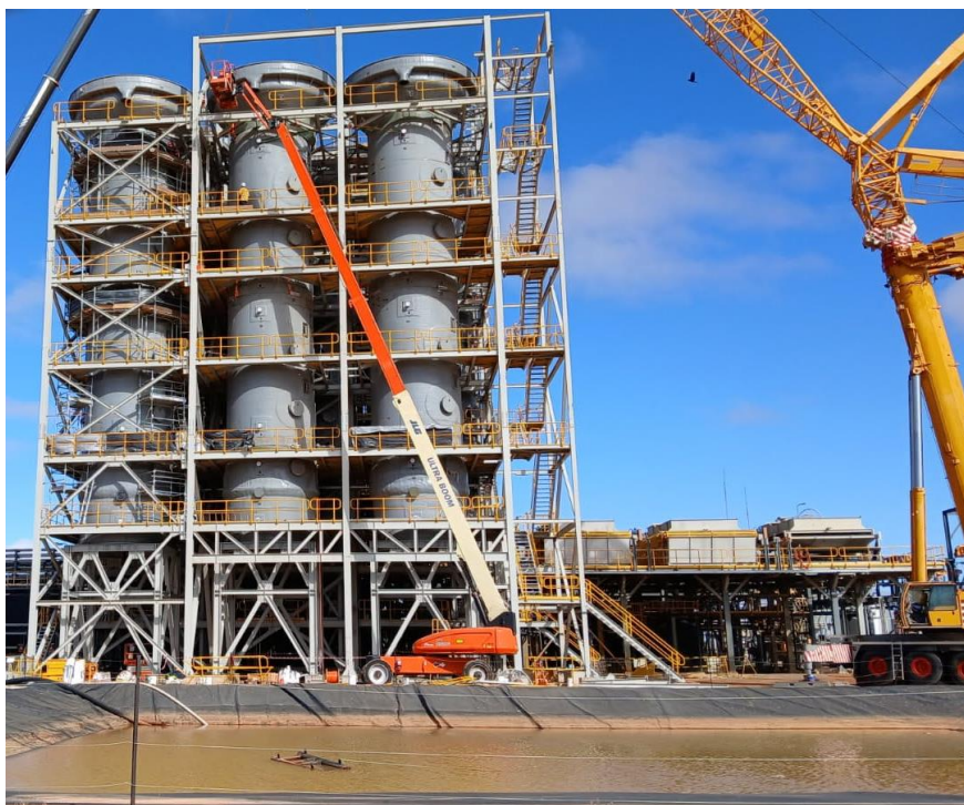
Figure 1: NIMCIX columns 4 to 6 installed

Along with the process plant construction, wellfield construction continues with wellfield 4 complete and in flushing, and wellfield 5 to be complete and commissioned in Q3 CY25. East Kalkaroo trunkline materials are on site, with construction to begin in August.