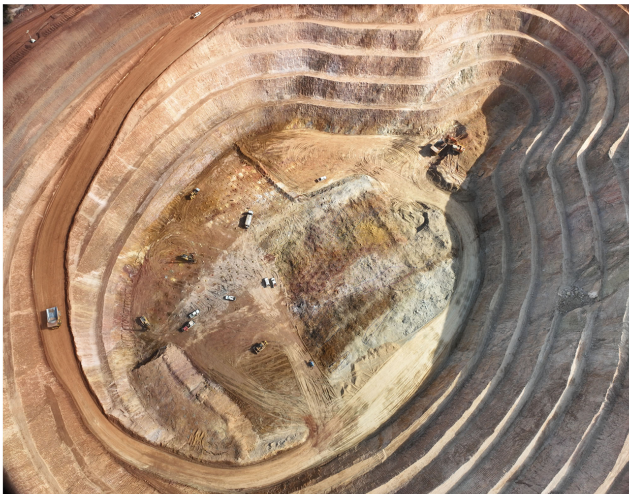
Figure 1: Myhree open pit is progressing ahead of schedule and is expected to be completed in October 2025. The portal for the Myhree underground will be located at the ~290mRL (~30m below the current floor).

Black Cat's Managing Director, Gareth Solly, said: “ The Myhree underground mining approval provides optionality for Kal East and mining approvals for other deposits are also expected soon. With Lakewood running well, and the open pits ahead of schedule, we are looking forward to a smooth transition to additional mines, as we continue our more gold sooner strategy. ”