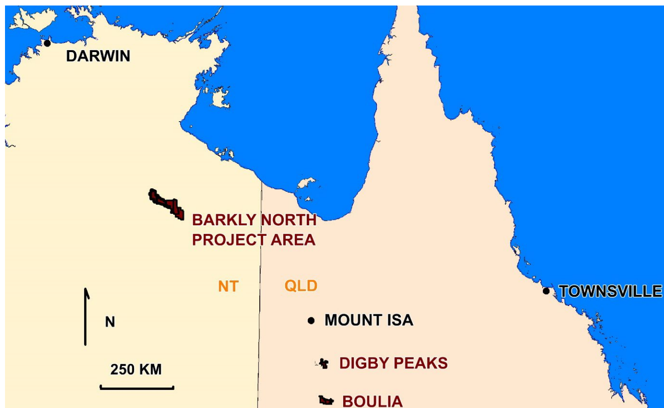
Figure 2. Locations of CML's Rare Earths and Uranium Projects in NT and QLD

Magnetic and gravity targets for base metals within the ELs will also be depth modelled.