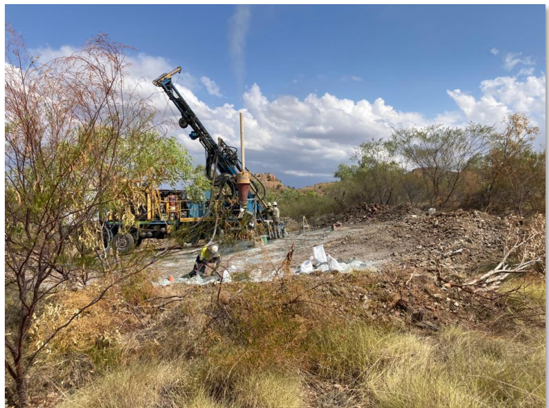
Plate 1: RC drilling at Raven prospect

“RC scout drilling was successfully completed over the five prospects. The first batch of samples from Mafic Sweats and Raven were submitted to the laboratory last week on rush and the remainder of the samples were submitted yesterday. In all,