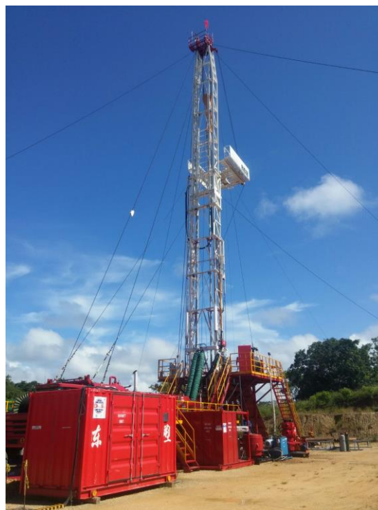
QUN 159 well site