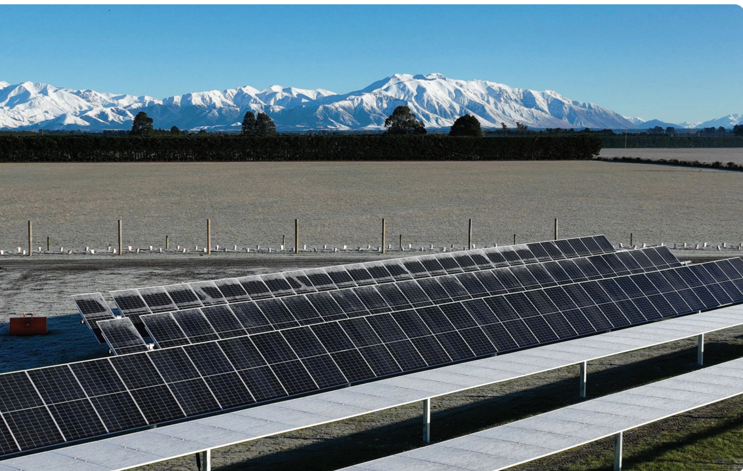
Lauriston Solar Farm - under construction

Light refreshments will be available immediately prior to and after the meeting.