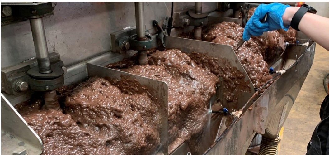
Figure 4 - Reverse Silica Flotation Circuit Pilot Test

Reverse silica flotation, the final step in the Project flowsheet, is displayed in Figure 4 below. This polishing step has proved to be critical in the production of high quality, low silica concentrate.