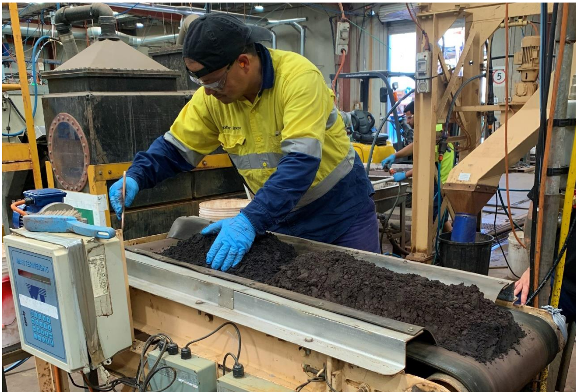
Figure 1 - Magnetic Concentrate Feed to Regrind Mill

'A key indicator of success in bringing a project into production is a full understanding of the ore body and how it behaves and the processing methodology that will be used. Test work begins at bench scale in the laboratory and once the process has been proved at that scale, a larger set of tests are undertaken to ensure that when the project is built at full scale it will work properly. During the test work at bench and pilot scale lessons are learnt and modifications are made to the circuit and re-tested and refined until the process is ready for full scale. This is the reason that AVL is taking so much care to do this work properly and reduce risk down the track.'