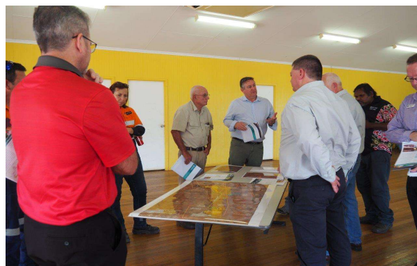
CAPTION: Recent Ardmore Project public information session in Dajarra.

A second public information session was held at the community hall in the local township of Dajarra to provide further information on the planned start-up operation. Members of the local community, business, local Council and State Government representatives attended providing positive feedback for the Company's planned operation. Additional sessions will be held in Dajarra and Mount Isa once the results of the start-up phase are known, to provide additional details of the proposed full-scale operation.