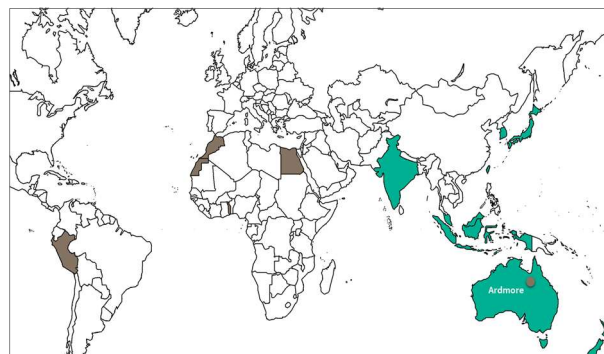
CAPTION: Map illustrating Ardmore target markets (green) and regional advantage over current suppliers (brown).

As announced during the quarter, a number of cost reduction design initiatives have been identified post completion of the DFS. The opportunities were identified from a series of independent reviews of the DFS by external consultants. Savings of A$ 5.7 million in capital and A$ 3/t in operating cost savings have been realised already with a number of other initiatives currently under assessment. Evaluation of the remaining items and corresponding updated designs from Centrex's consultants are expected to be completed next month, with revised DFS estimates and financials expected to follow.