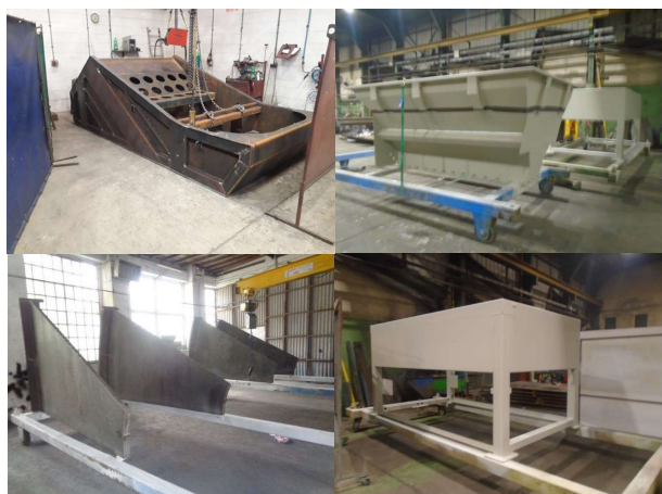
CAPTION: Fabricated sections of the Ardmore modular process plant at CDE Global.

capacity of 70tph and has been designed to be expandable to 140tph for the full-scale operation designed at 800,000 wet tonnes per annum.