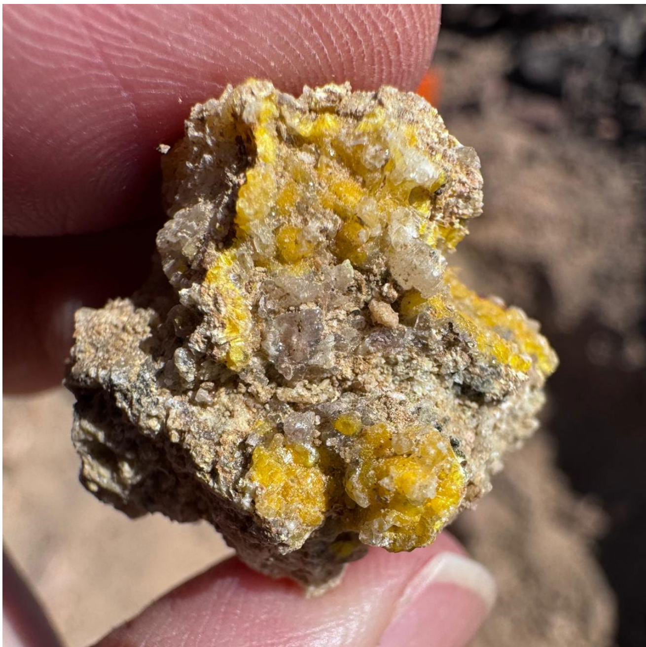
Figure 3. A field specimen of uranophane (a secondary uranium mineral) gathered from the site of sample CMRS4 at the Etango North-East Project