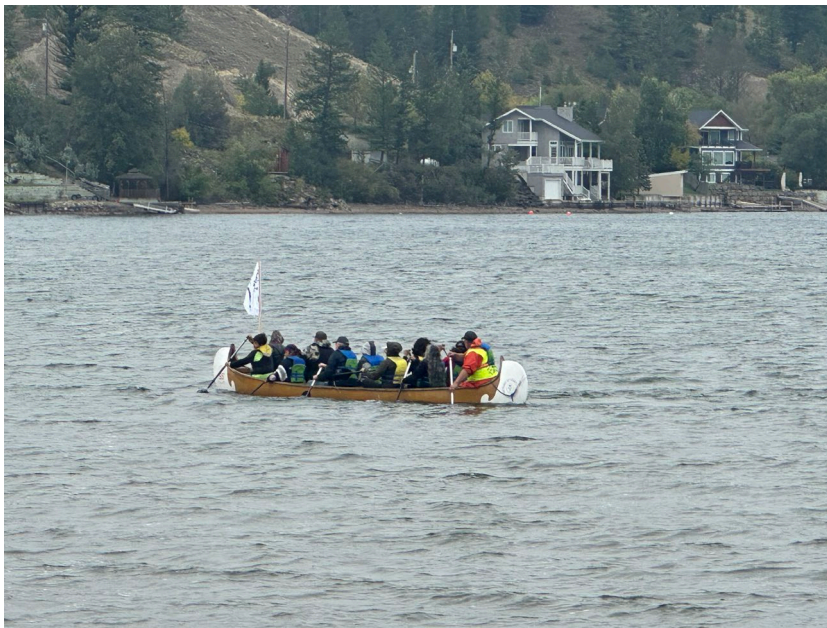
Figure 5– Shuswap Band Salmon Festival – Invermere, BC (Sep 24)

During the summer, Company representatives participated in Pow-Wows, Sun Dances and other annual cultural festivals with a number of the key Indigenous Nations.