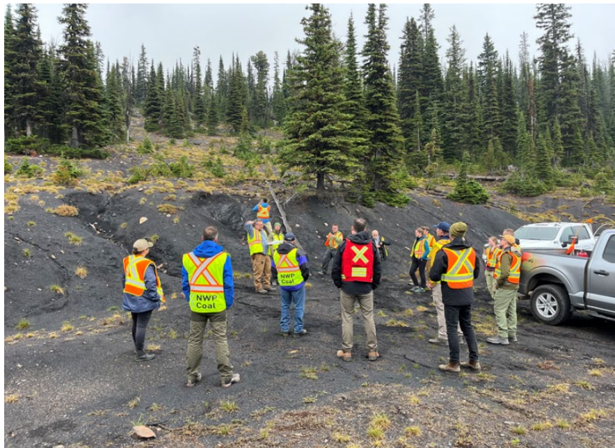
Figure 3 – Regulator Site Visit, Sep-24

The completed EIS/EAA was the subject of formal Public and Technical review during February and March 2024. In May, Jameson received all submissions on the EIS/EAA from Indigenous Nations, community groups, members of the public and Government agencies. These submissions included requests for additional information and/or clarification on effects assessment outlined in the EIS/EAA.