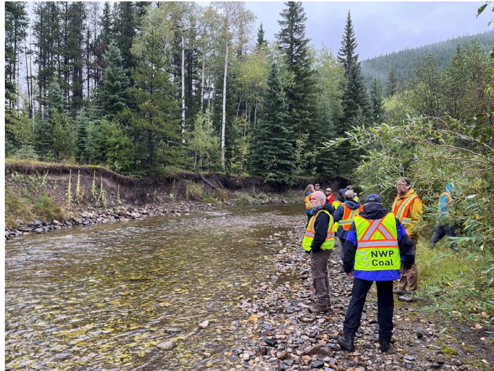
Figure 4– Regulator Site Visit, Sep-24

The Crown Mountain Hard Coking Project is the only steelmaking coal development project in Canada that has reached the joint Federal and Provincial Application Review Phase.