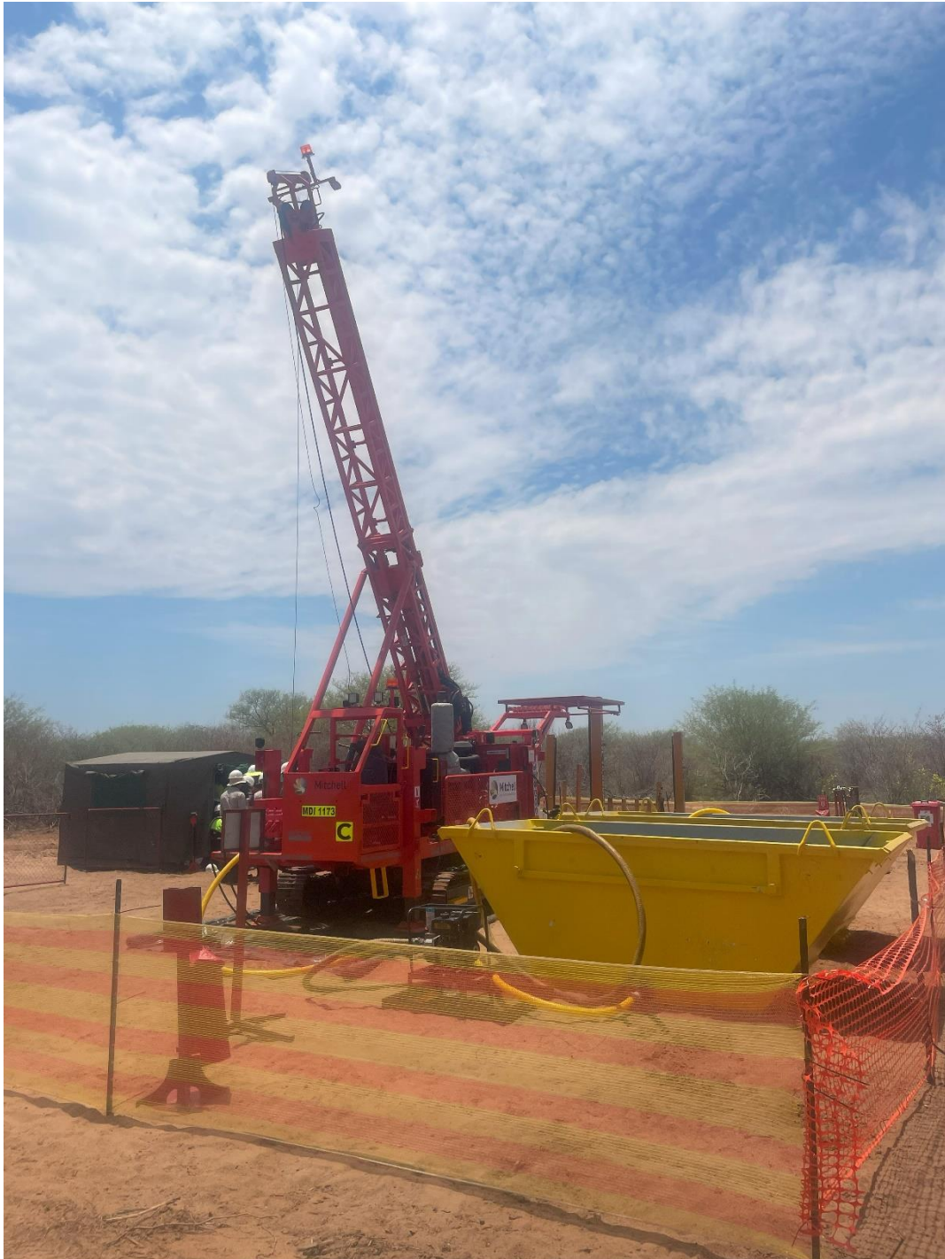
Diamond drill rig ready to commence 2024 drill programme, Ngami Copper Project.

The planned exploration and infill drill programme is illustrated in Figure 1 . A project locality map is provided in Figure 2 .