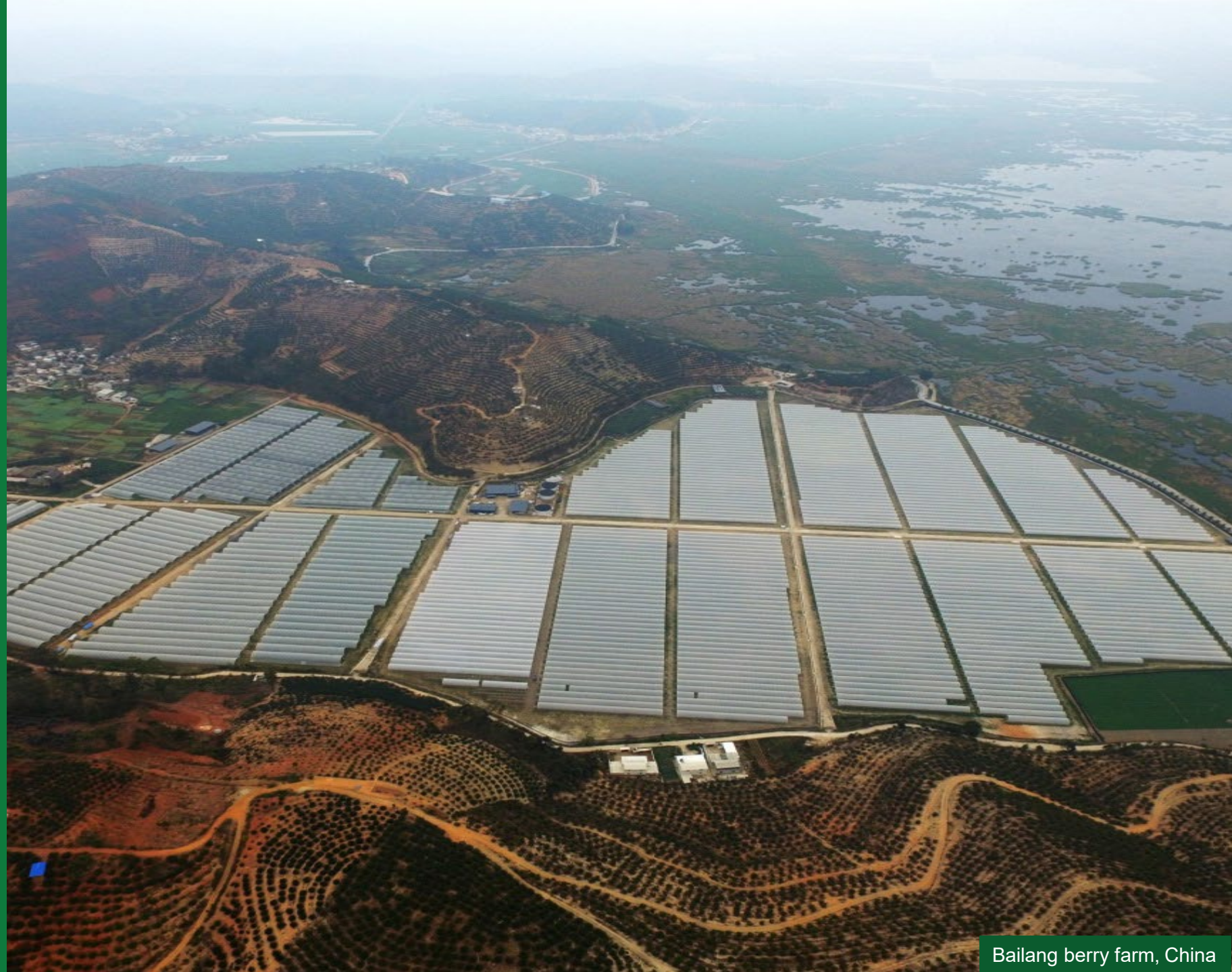
Bailang berry farm, China