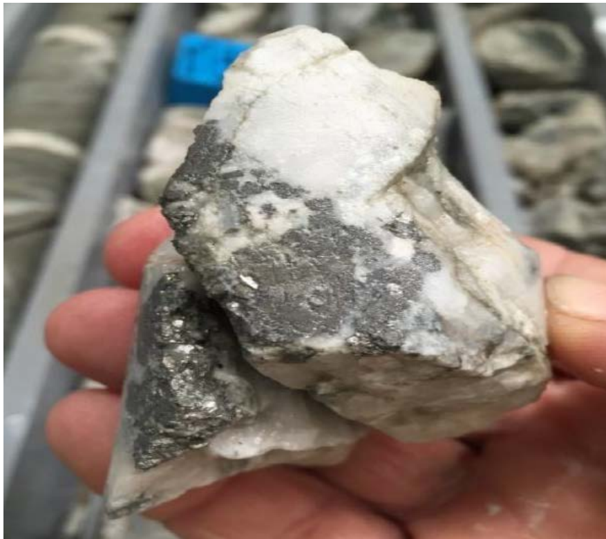
Photo 1 Drill core from hole CCD001 displaying mineralised quartz veining with arsenopyrite