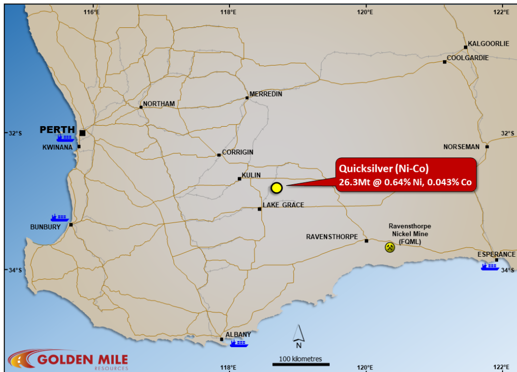
Figure 1. Location of Quicksilver Nickel-Cobalt Project

The Quicksilver Nickel-Cobalt Project (“ Quicksilver ”; “ the Project ”) is approximately 50km 2 in area and covers a belt of mafic-ultramafic rocks (greenstones) prospective for nickel sulphide and nickel laterite mineralisation. The Project is located near the town of Lake Grace (approximately 300km SE of Perth) on privately owned farmland in an area with excellent local infrastructure, including easy access to grid power, sealed roads, and a railway line connected to key ports ( Fig 1 ).