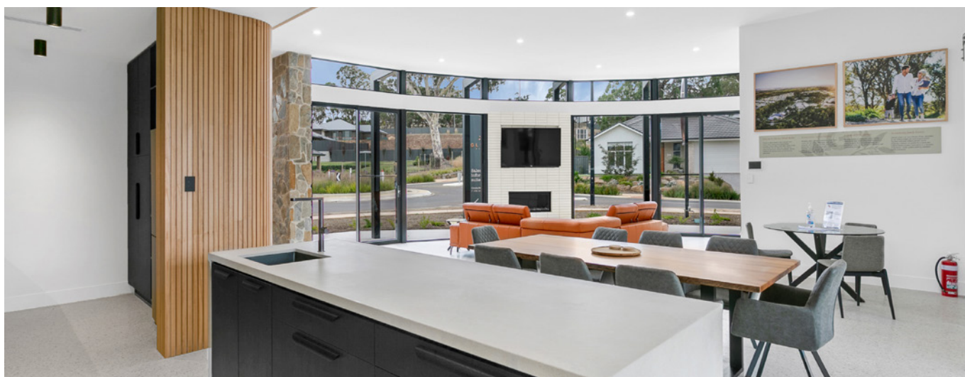
Glenlea, Mt Barker

During the year the Company announced along with its Joint Venture Partner that it had reached conditional agreement with Living Choice to sell circa 10 hectares of land for $5.5m to develop an Over 55's Lifestyle Community. The parties continue to work together to meet the conditions precedent to allow settlement, which is expected to occur early FY2022.