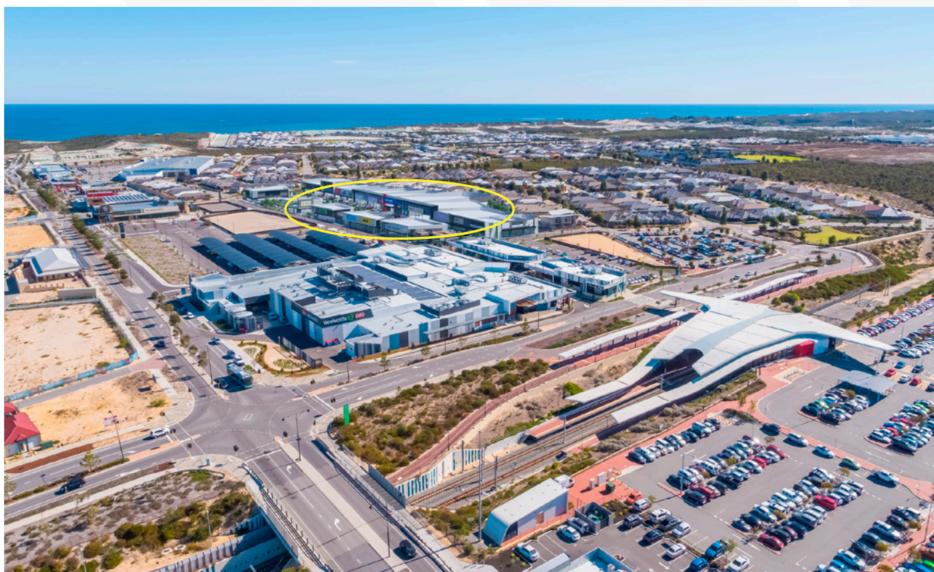
Artist impression proposed Butler large format retail centre and existing Woolworths retail centre, Butler

The Company settled the property with Woolworths' development arm, Fabcot on Thursday 24th June, funded from cash reserves. Subsequent to year end the Company agreed to enter into a design and construct contract with ADCO and construction commenced in July, which is due for completion in May 2022. The Company has mandated BankSA to provide construction funding and is well placed to achieve financial close in the coming months as construction gets underway.