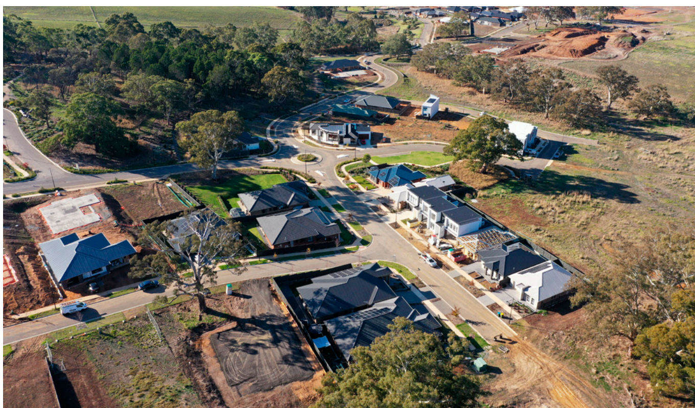
Glenlea Estate, Mt Barker

During the year, the Company and its partner completed construction of stage 1b which consists of 43 allotments. As a result of selling and settling 42 of the stage 1b allotments, the Company and its partner commenced construction of stage 1c and brought to market a further 14 allotments adjacent to stage 1b, which were completed in May 2021. 13 of these allotments were contracted during construction with settlements commencing thereafter. The Company and its partner continue to sell the remaining allotments available which are ready for immediate settlement.