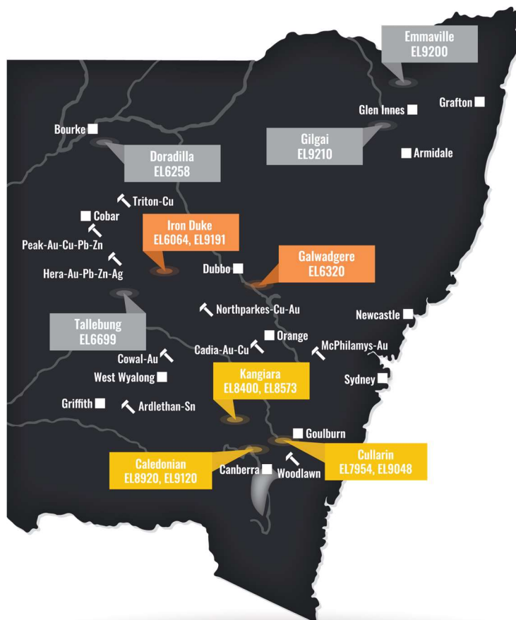
Figure 3: SKY Tenement Location Map

Highlight, 'McPhillamys-style' gold results from previous exploration include 36m @ 1.2 g/t Au from 0m to EOH in drillhole LM2 and 81m @ 0.87g/t Au in a costean on EL8920 at the Caledonian Project. The distribution of multiple historic drill intersections indicates a potentially large gold zone with discrete high-grade zones, e.g. 6m @ 8g /t Au recorded from lode at historic Caledonian Mines (GSNSW). A strong, robust soil gold anomaly (600 x 100m @ +0.1ppm) occurs and most drillholes (depth ~25m) terminate in the mineralised zone.