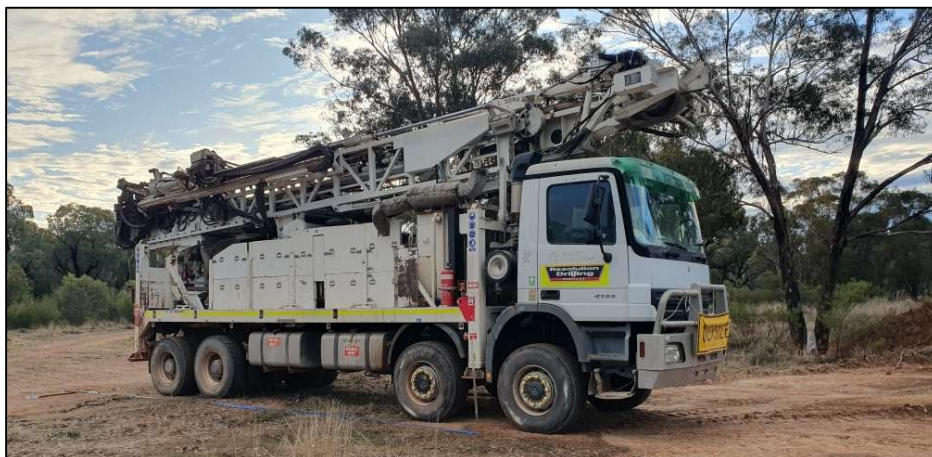
Figure 1: Tallebung Tin Project – RC drilling rig onsite at the Tallebung Tin Project.

SKY CEO Oliver Davies commented: "This is an exciting program commencing for SKY. The program is targeted to both significantly increase the mineral resources while also increasing confidence in the large resources defined at Tallebung. Building the size and confidence in the tin resources at Tallebung will then allow SKY to launch into mine scoping studies following the completion of this current drilling campaign and subsequent updated mineral resource estimate. This will position SKY strongly to further develop the exceptional bulk tonnage tin mining potential at Tallebung."