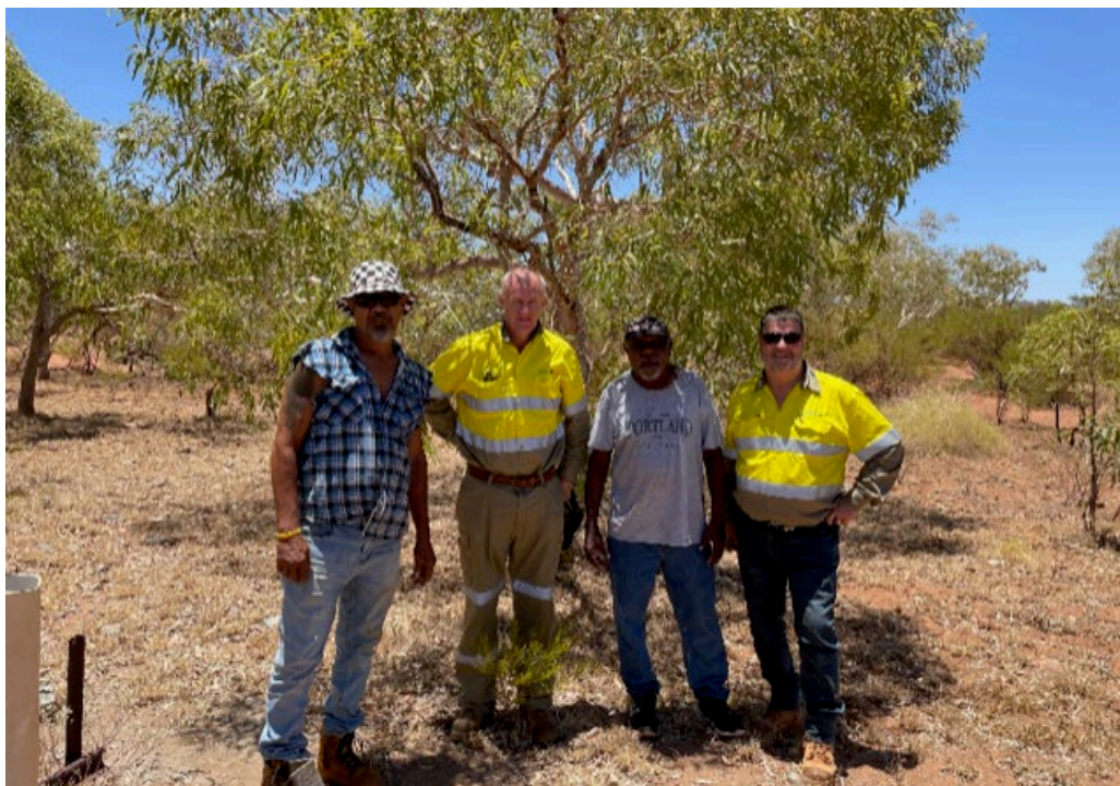
Figure 3: Morella staff on site at Mallina with Traditional Owner representatives

During the reporting period, the Company commenced engagement with the Traditional Owners and Knowledge Holders of the lands that are covered, in part, by the Mallina tenement. Initial meetings and briefings of proposed exploration activity were held in Port Hedland. A follow-up site visit was conducted in December with representatives of the Traditional Owners (figure 3), where they were shown Morella's planned exploration locations. The site visit allowed the Traditional Owners and the Company to plan the conduct of a heritage survey in Q1 2022 which, once completed, will be another step forward towards the conduct of exploration activities in a considered manner, paying due regard and respect to the Traditional Owners. Morella also commenced negotiations with the Pastoralists that operate at Mallina Station. Both the Pastoralists and Morella are engaging openly and seeking practical solutions for utilities and infrastructure usage that will benefit both parties.