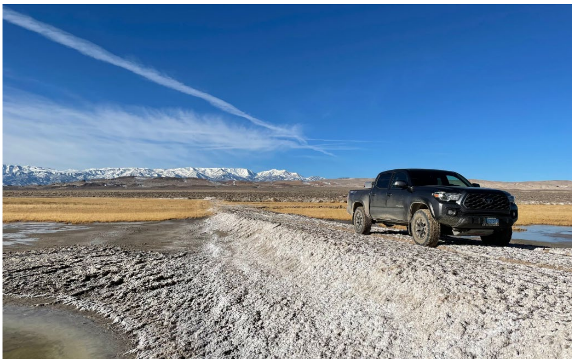
Figure 1: Fish Lake Valley salt playa – December 2021

Results from the passive seismic survey will be released to the market when available whilst adhering to appropriate quality assurance and quality control protocols.