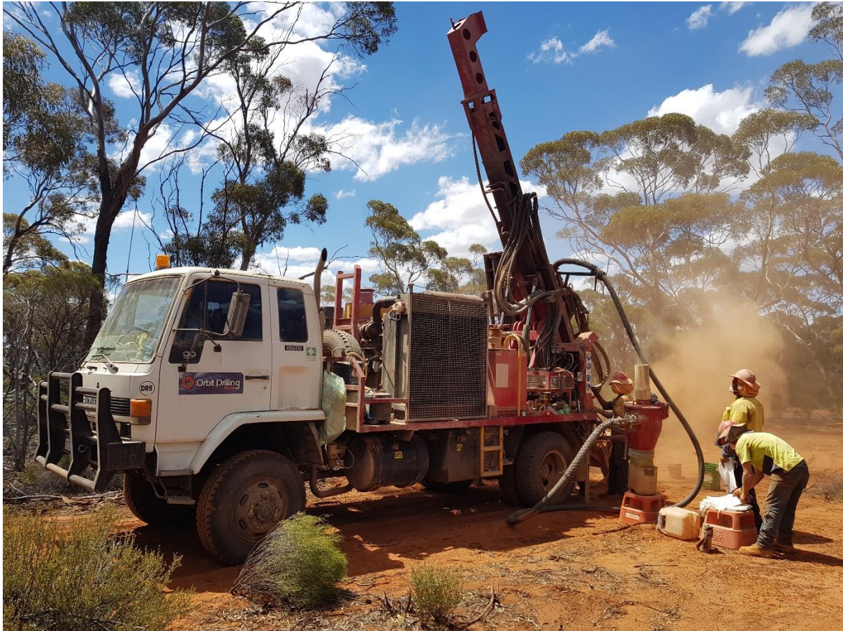
Figure 4: Photo showing RC drilling in operation at Paradigm North.

At this early stage no priority targets ( +0.5\text{g/t Au} ) have been identified by this drilling and further interpretation of this new data is required before additional drilling is contemplated.