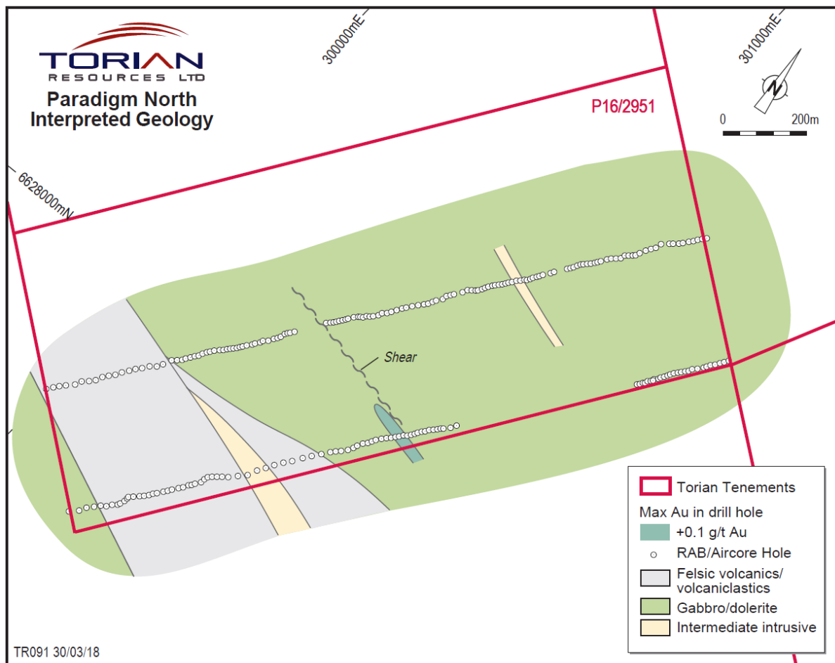
Figure 3: Map of Paradigm North showing geology, tenements, and drilling.

A total of 258 holes totalling 6,752m were completed, testing the target over a strike length of 400m. The drilling was designed to test the mineralisation with overlapping angled holes. The depth of the holes was extremely variable due to the hardness of the ground. Some sections of the drill traverses were not drilled due to the outcropping dolerite. The holes were drilled on two 2.1km long sections being 400m apart. The area is covered by a variable but generally thin veneer of transported soils, and outcrops are limited away from the exposed dolerite unit.