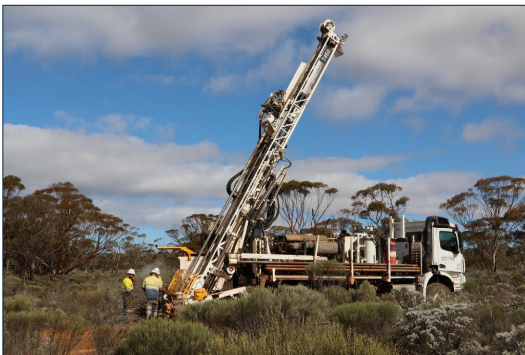
Figure 1: Strike Drilling AC/RC drill rig on site at Killaloe.

Lachlan Star Limited (ASX: LSA, Lachlan Star or the Company ) is pleased to advise that its maiden drilling program has commenced at the 100%-owned Killaloe Gold Project, located within the Norseman region of the Eastern Goldfields of Western Australia.