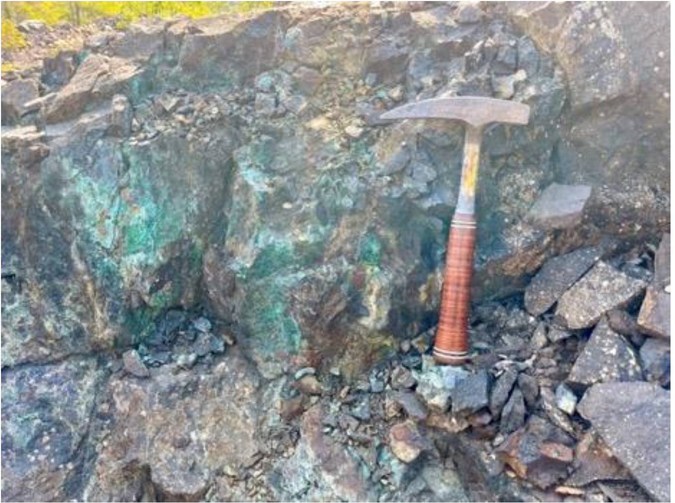
Figure 3 - Outcropping mineralisation at the Thompson prospect.