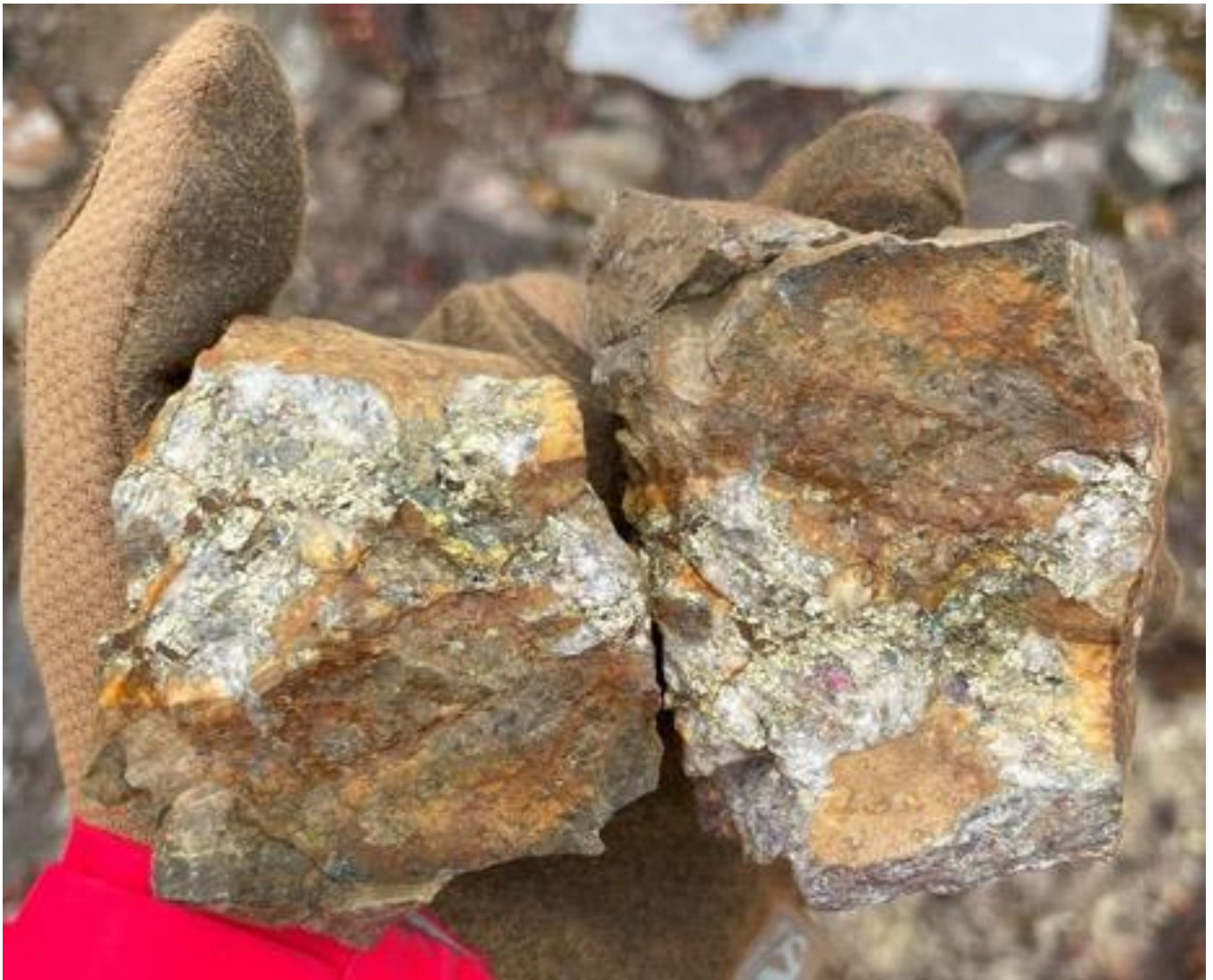
Figure 11 – Observed quartz-chalcopyrite vein with minor bornite from the Glacier epithermal trend which has been sampled over 200m strike length. (Sample F005424)