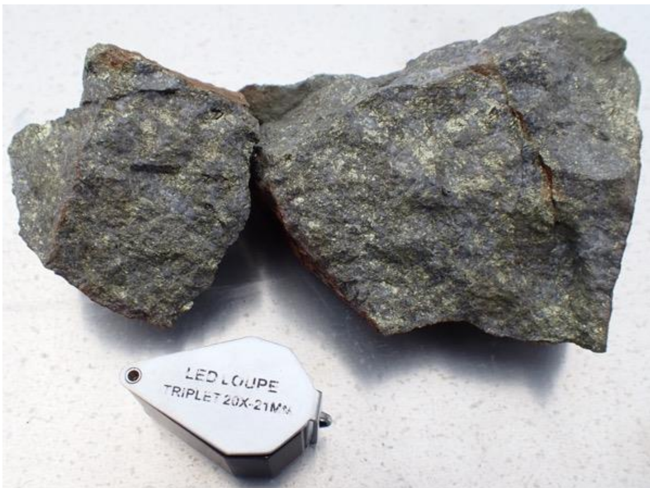
Figure 12 - Example of the Sparkplug Lake quartz-chalcopyrite veining which occurs within a 430 x 160m zone. (Sample F005670)