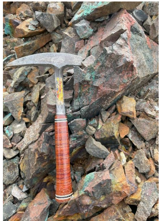
Figure 9 - Example of visually observed bornite-chalcopyrite cemented breccia (Sample F005437) (left) and strong brick red potassic alteration with observed chalcopyrite-malachite veining from the western extent of the Glacier IOCG target (Sample F005611) (right).