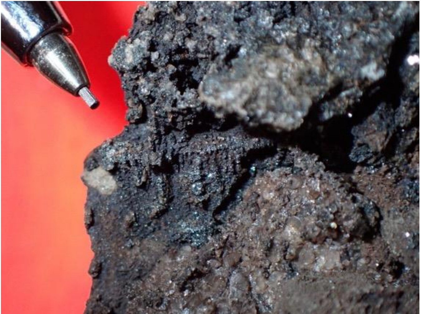
Figure 6 - Example of herringbone texture in possible native silver bearing sample taken 530 m NW of the historic Bonanza Silver Mine. Associated with calcite-fluorite veining and chlorite alteration (Sample F005416).