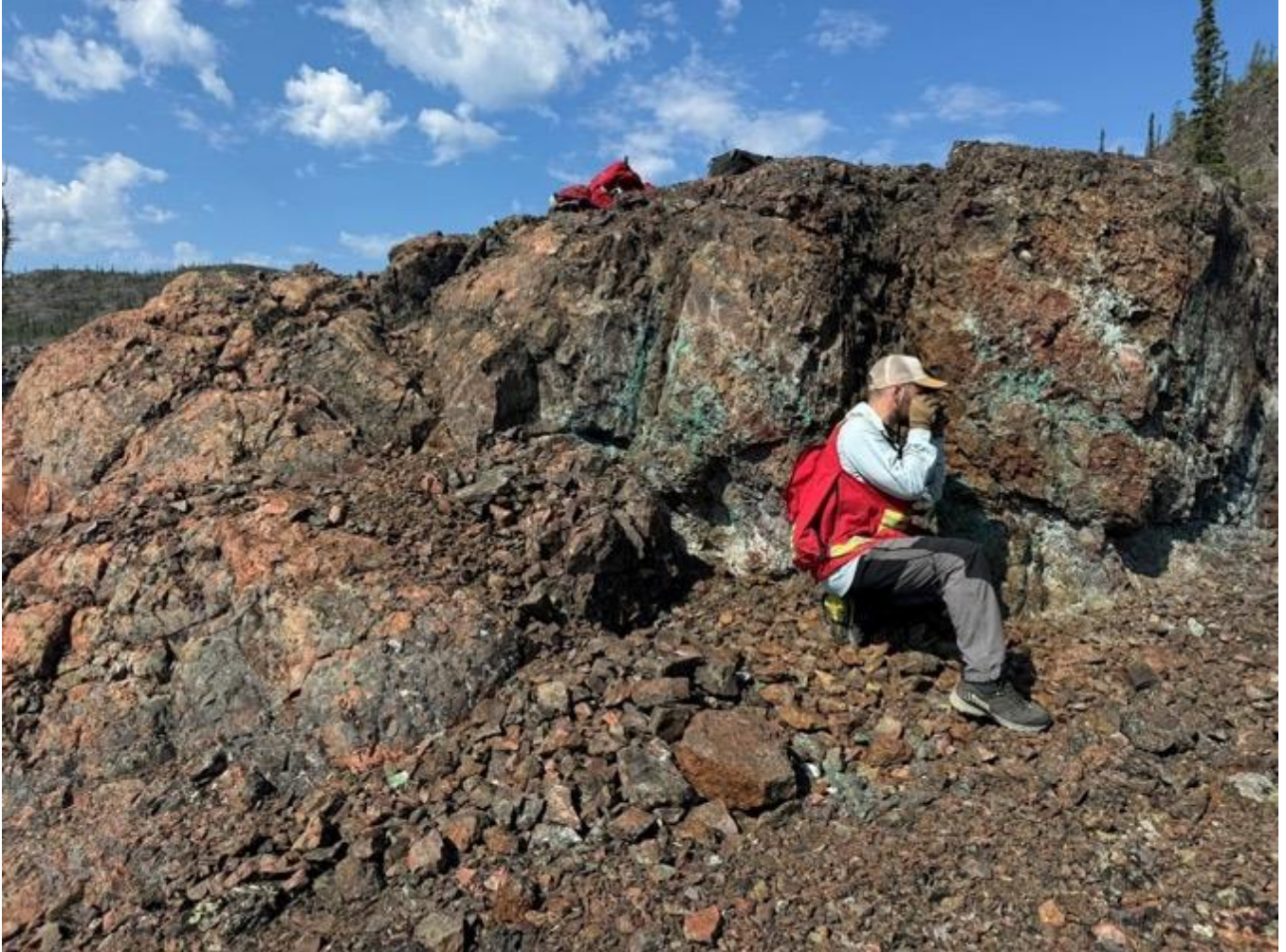
Figure 1 - Outcrop of the Mile Lake Skarn Breccia displaying widespread secondary copper mineralisation throughout the 10-15m thick skarn-breccia interval

11 rock chip samples were collected on a semi-regular grid across the mineralisation with a surface footprint of 55 m NW/SE and apparent thickness of 10-15m.