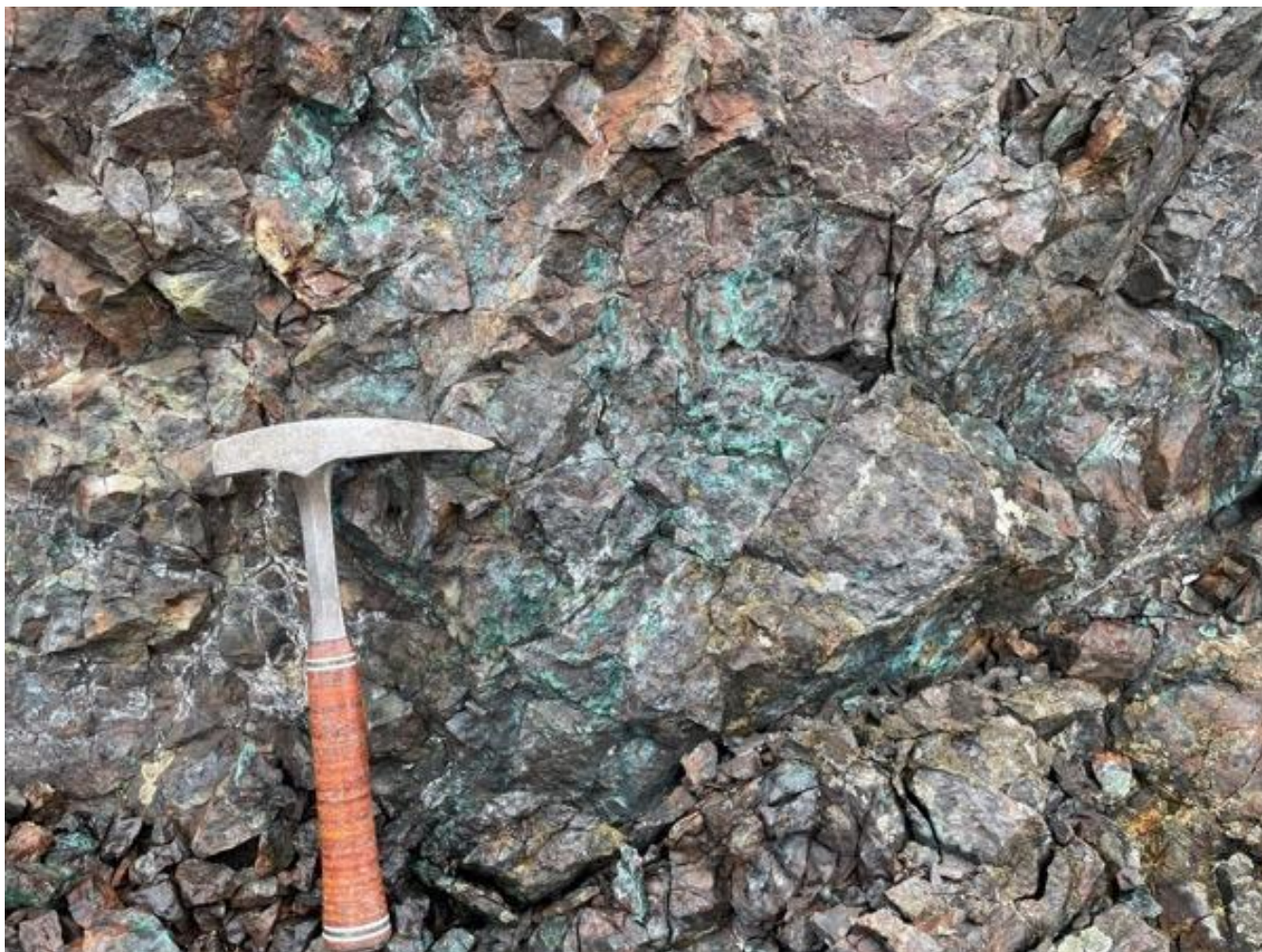
Figure 10 - Example of visually observed malachite staining of the potassic altered andesites at the eastern extent of the Glacier trend. Photograph shows a part of the 10m thick mineralised outcrop which is continuous on surface for 60m.