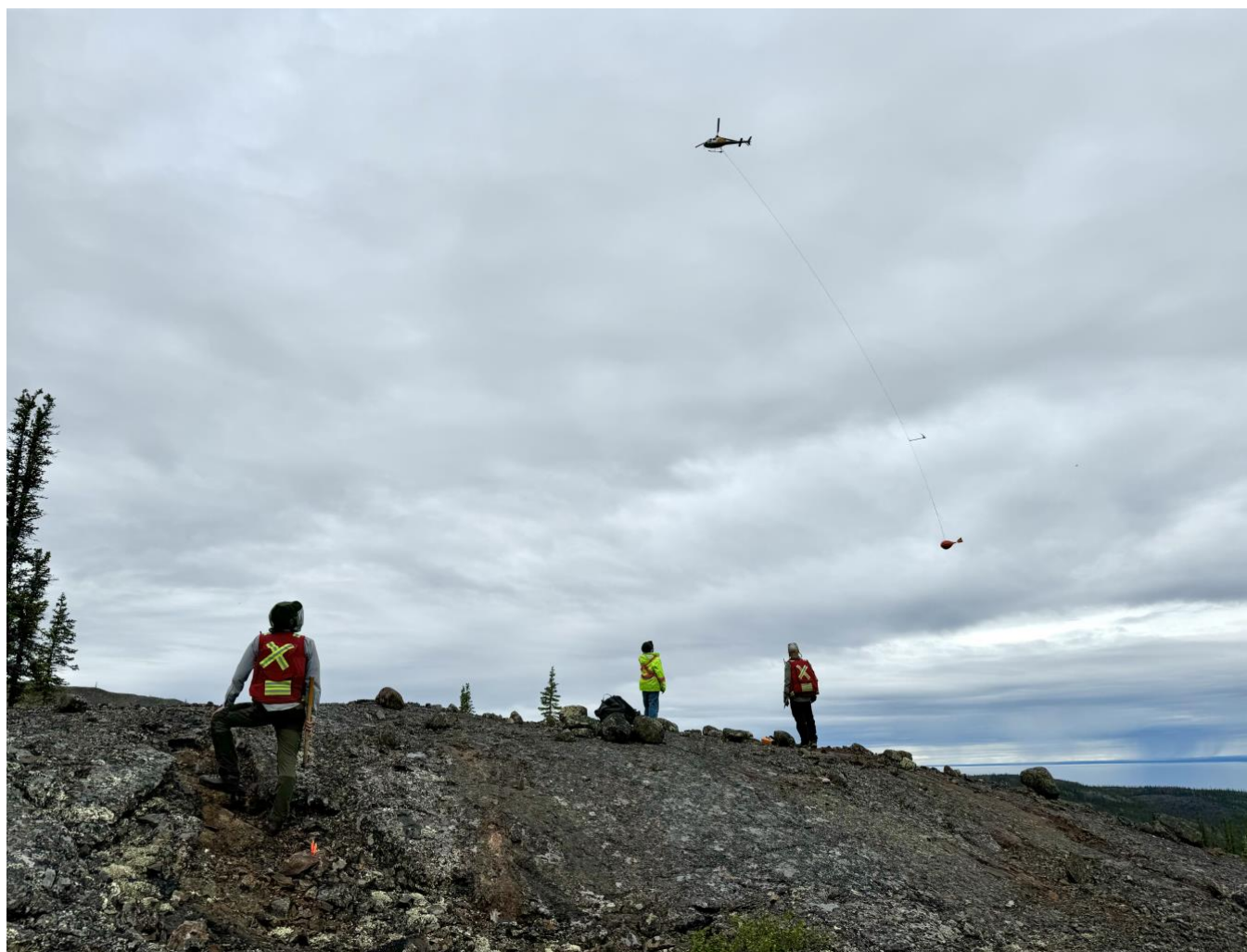
Figure 0 - Heli mounted MobileMT aerial surveys and field works underway at Great Bear Lake