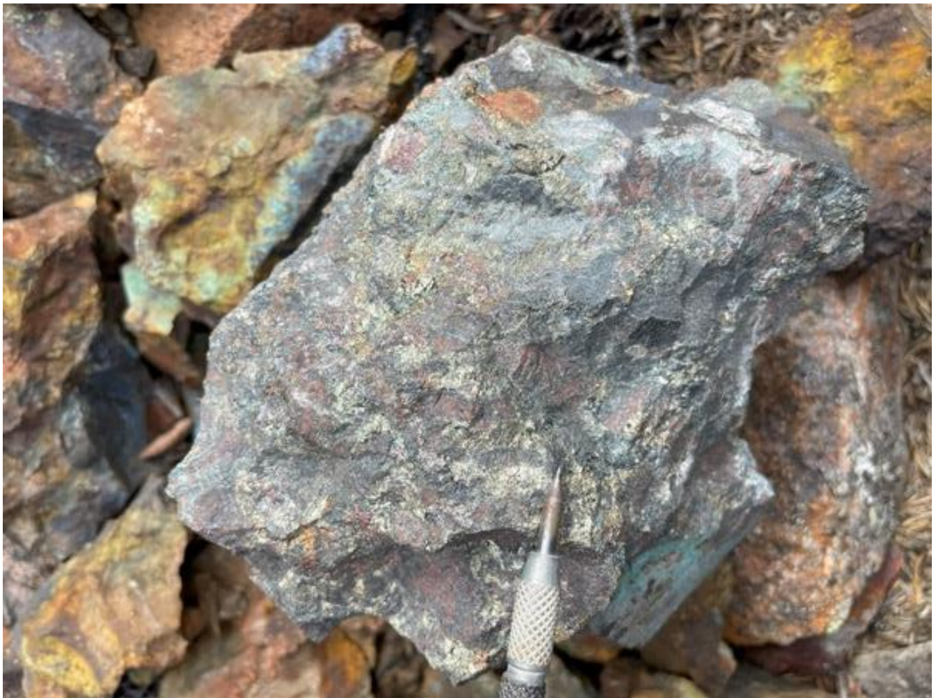
Figure 8 - Example of visually observed chalcopyrite cemented breccia from the western extent of the Glacier IOCG target. Clasts are composed of brick-red k-feldspar altered andesite. (Sample F005438)