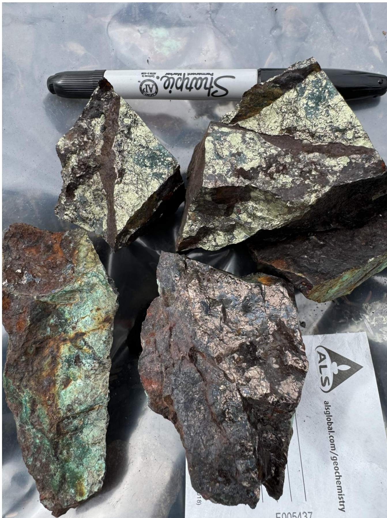
Figure 7 – Rock sample F005437 from a mineralised outcrop of massive chalcopyrite-bornite at the Glacier Target.