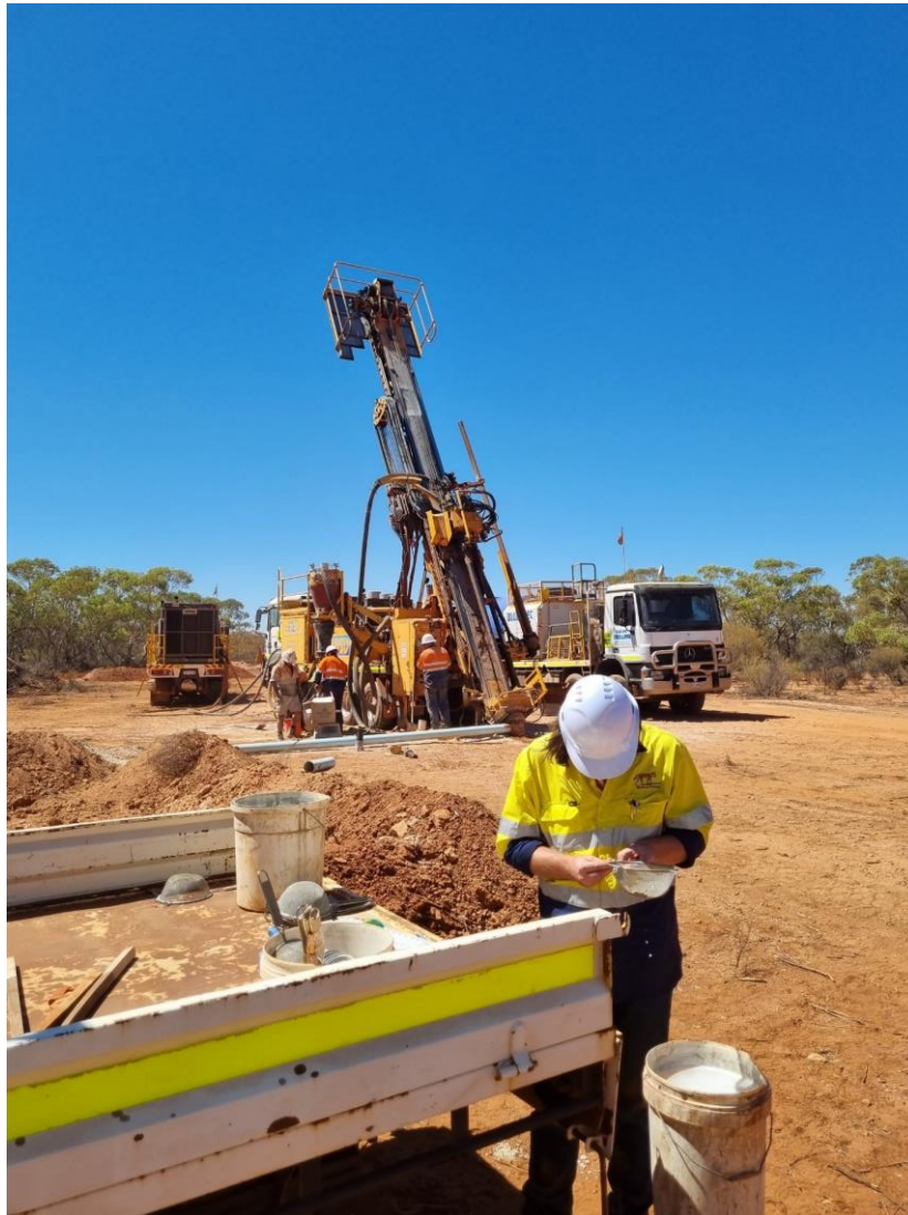
Drilling underway at Minjina with Cosmo geologist logging at MIRC010

This announcement is authorised for release to the ASX by the Board of Cosmo Metals Ltd.