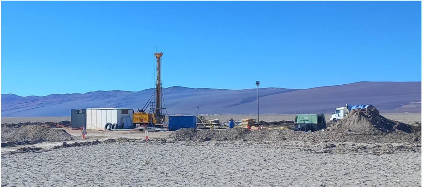
Figure 4 - Drilling at DDH-2 at the Sal Rio 02 Tenement

Drilling progress at DDH-2 has continued with the hole set for completion by the end of August 2024 with multiple packer samples already taken from shallower depths.