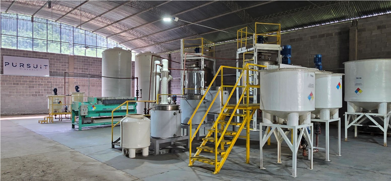
Figure 6: 250tpa Lithium Carbonate Plant at Pursuit's purpose facility in Salta, Argentina

The Pilot Plant allows for the testing of the circuit chemistry in a real time environment seeking to minimise both scalability and quality control issues. The Pilot Plant will look to produce an initial sample batch using synthetic brine of approximately 50-100kg of product.