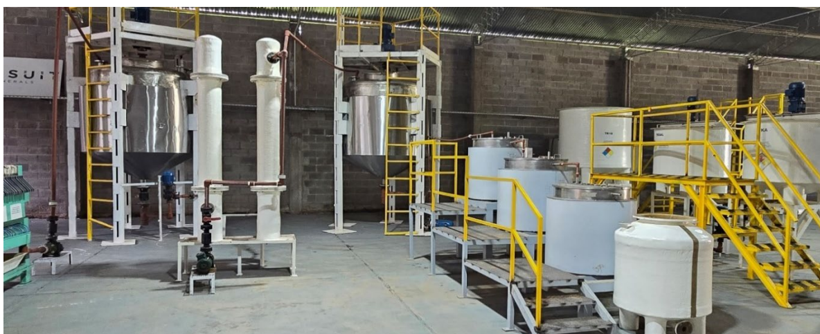
Figure 5: 250tpa Lithium Carbonate Plant at Pursuit's purpose facility in Salta, Argentina

During the quarter, the Company continued the start up works of the Lithium Carbonate Pilot Plant following its commissioning working toward first production of Lithium Carbonate of both battery and technical grade.