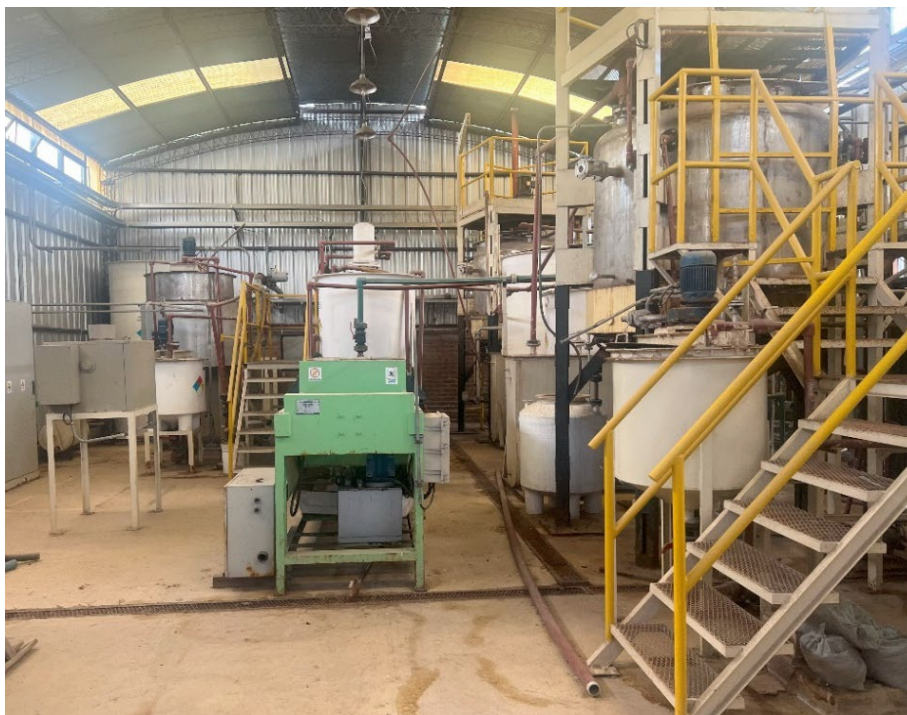
Figure 1 – Pilot Plant during site visit March 2023

Pursuit Minerals Ltd (ASX: PUR ) ("PUR", "Pursuit" or the "Company") is pleased to announce the acquisition of a Lithium Carbonate Pilot Plant located in the city of Salta, Argentina.