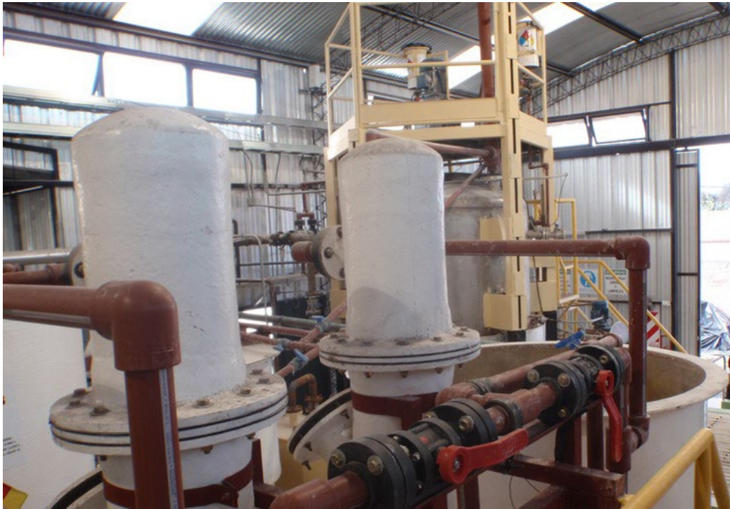
Figure 3 – Lithium Carbonate Pilot Plant

Pursuit's primary focus and principal Stage 1 production milestone is to produce consistent technical and battery grade Lithium Carbonate Equivalent ("LCE") production for on-going operations, whilst also confirming the chemical engineering and block flow process is efficient, cost effective and scalable for all development stages of the Rio Grande Sur Project. The Pilot Plant has a nameplate production capacity of 100 tonnes of Lithium Carbonate per annum. Throughout this development stage, the Company will additionally evaluate a circuit for Lithium Hydroxide production from Lithium Carbonate in line with growing market demand for both products.