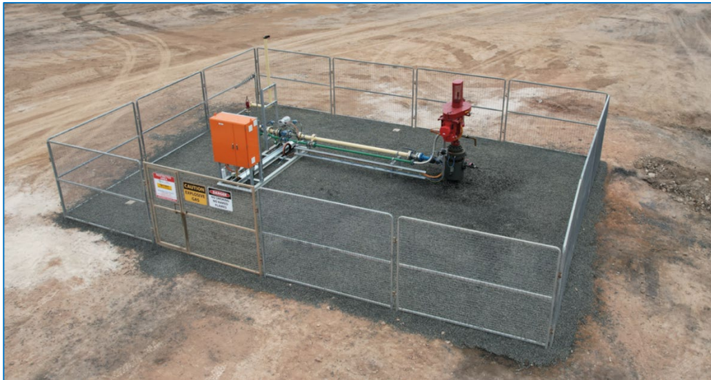
Figure: GM181, 1st producing well of the 7 well program