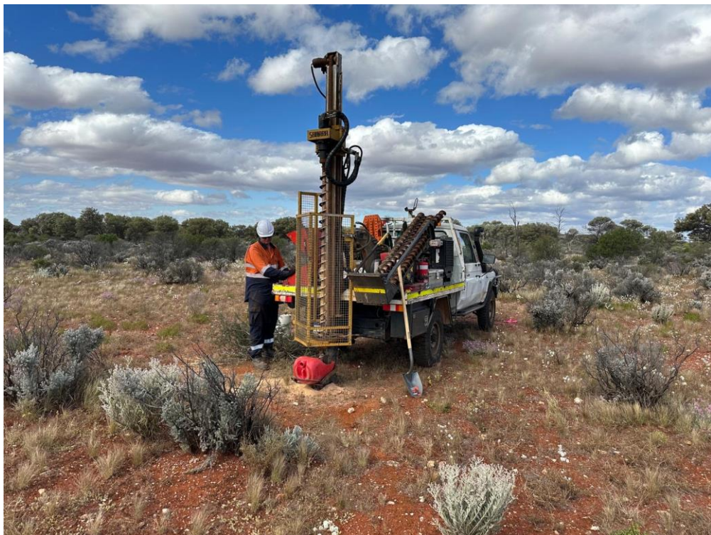
Augur Sampling at the Binbury Prospect August 2024

Against a backdrop of continuing weak spodumene pricing, a decision will be made in the current quarter on further spending on the Other Minerals JV. The drilling program for the lithium pegmatites on E 29/510 is north of the JV's magnetite JV with Hancock (see tenement map above).