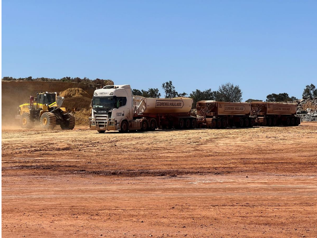
Low grade stockpile haulage to Paddington Mill

Given recent weather events and road closures in the Goldfields, this ore will now be treated in the September quarter generating a surplus for the JV. Discussions are also underway to treat further low grade stockpiles on the JV's tenements.