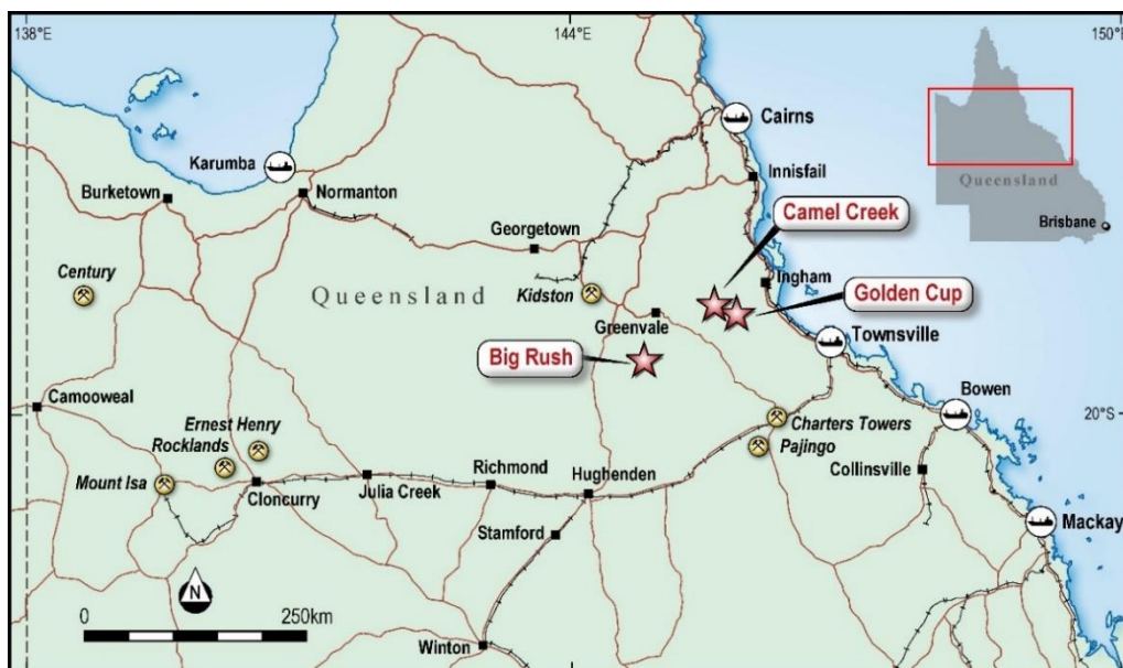
Figure 1: Location of the Golden Cup, Camel Creek & Big Rush gold projects