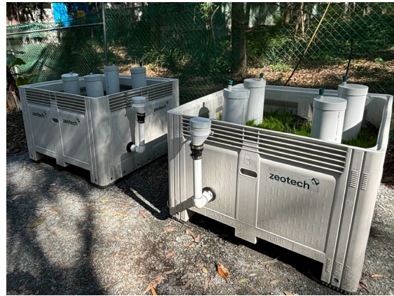
(above) simulated landfill configurations located at Griffith University

Two configurations contained the Company's zeoteCH 4 ® products, which showed constant high oxidation rates in Activities A & B. The zeolite-based products are manufactured from the Company's Toondoon kaolin mineral and a coal combustion by-product from a southeast Queensland generator, utilising proprietary processing technology developed in-house by the Company.