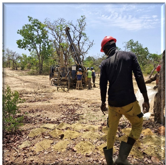
Figures 2 & 3 \ AC drilling at Ferké Gold Project