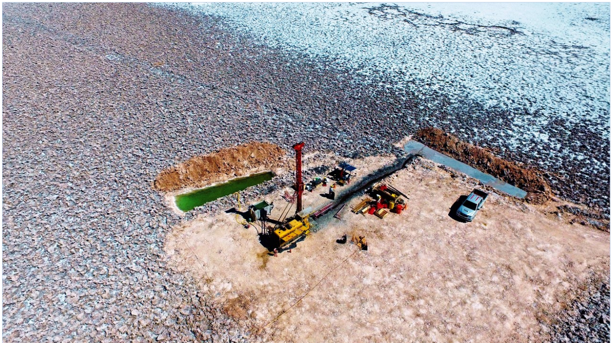
Figure 3. Rincon Lithium Project – Drilling Operations

These works are to provide data input into modelling works within the PEA that will provide a mine-life estimate for lithium brine operations at the Project.