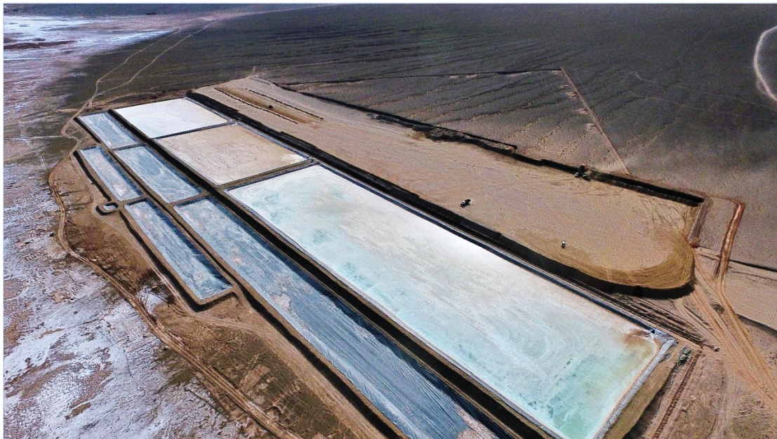
Figures 4-5. Rincon Lithium Project – Stage 2 Evaporation Ponds