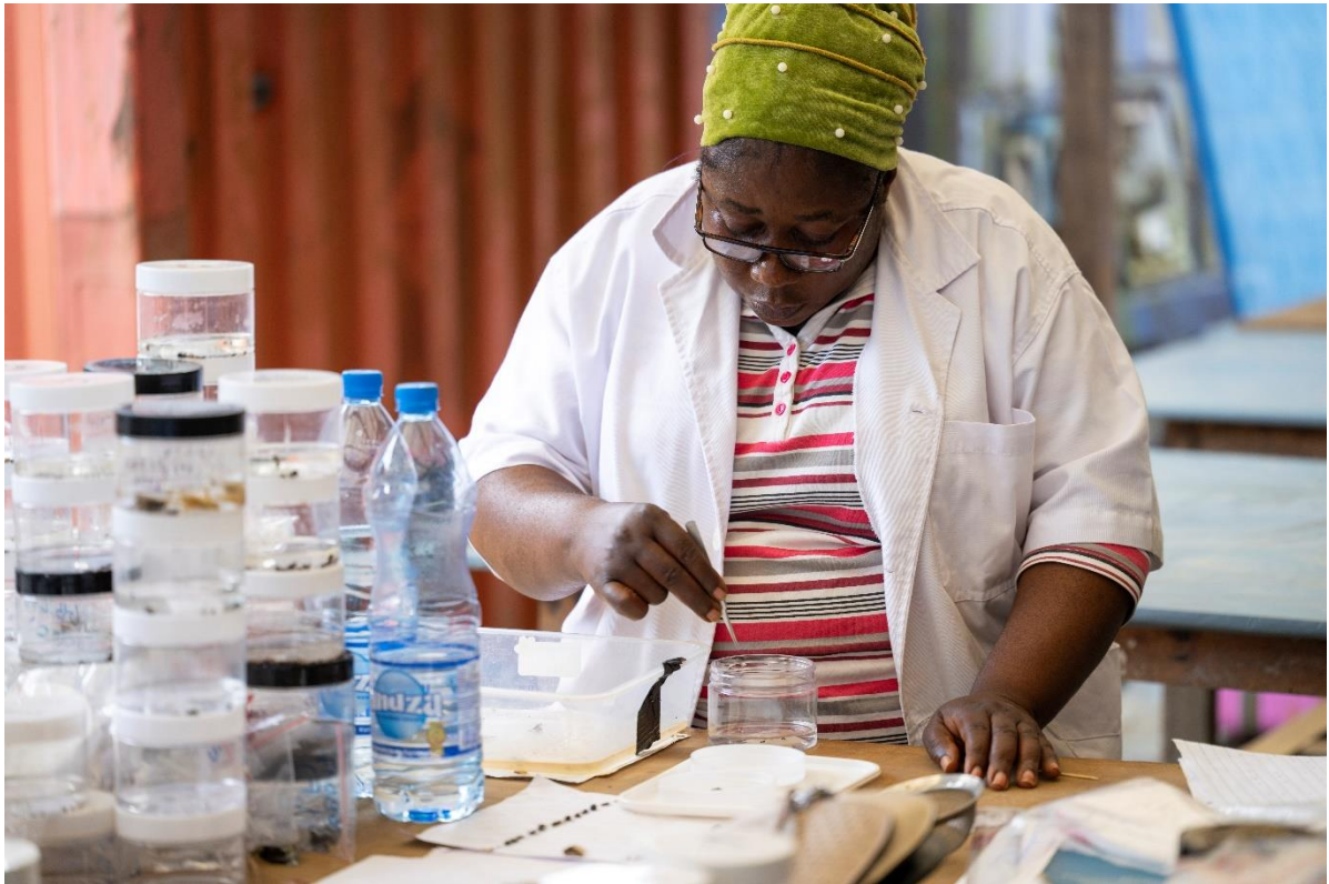
Figure 4: Local environmental scientist from IRET, working on samples from the wet season biodiversity survey