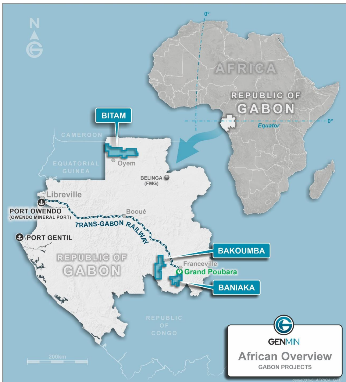
Figure 1: Location map of Genmin's iron ore projects in Gabon, west Central Africa

Genmin's flagship project, Baniaka, is at feasibility stage with defined JORC Code (2012 Edition) compliant Mineral Resources and is favourably situated adjacent to existing and operating bulk commodity transport and renewable energy infrastructure.