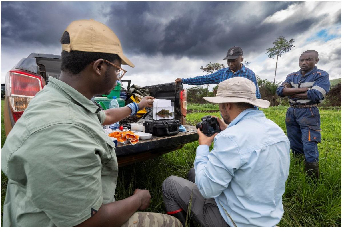
Figure 5: Members of FFMES & IRET, in the field during the wet season biodiversity survey