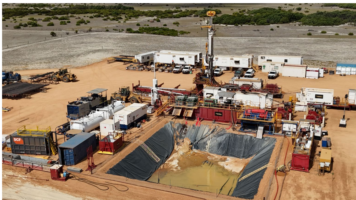
Figure 1: Drilling Rig on Becos-1 location

Becos-1 is being drilled by the EP 437 Joint Venture, comprising subsidiaries of Triangle as Operator 50%, Strike Energy Ltd (ASX: STX ) 25% and Echelon Resources Ltd (ASX: ECH ) 25%.