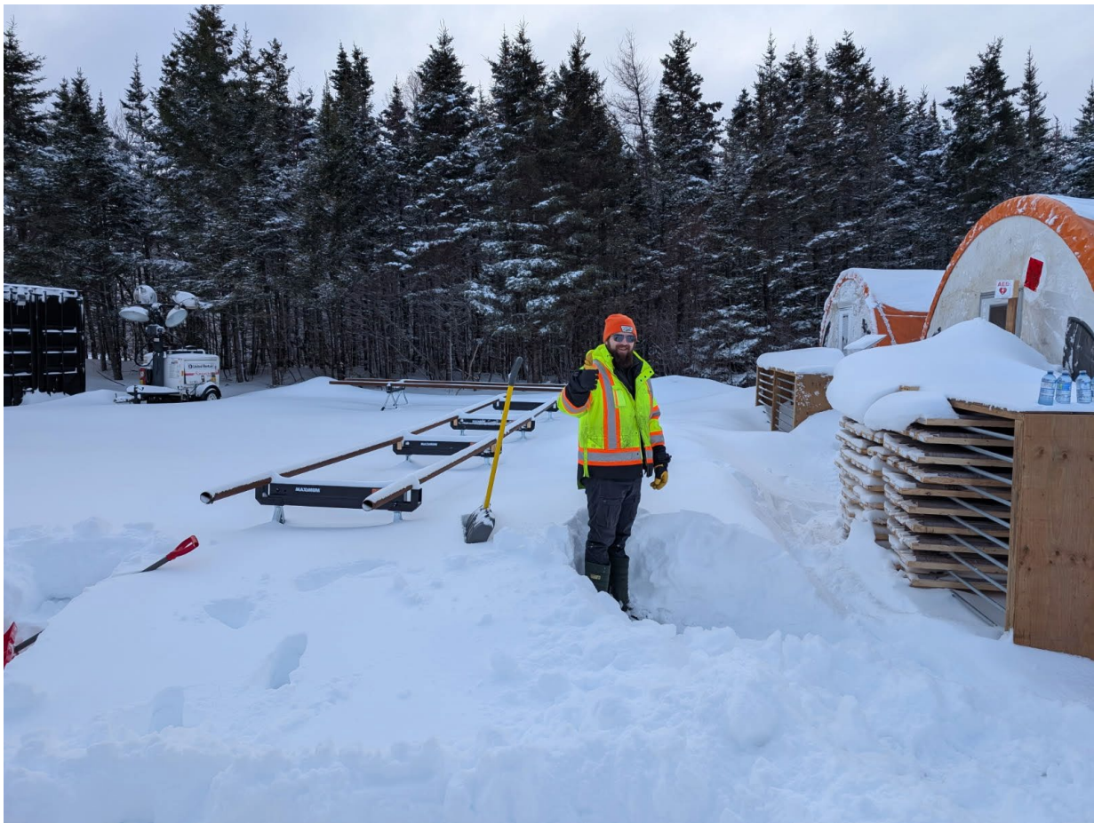
Figure 2: An on-site geologist digging out a path to the core shacks after the most recent snowstorm.