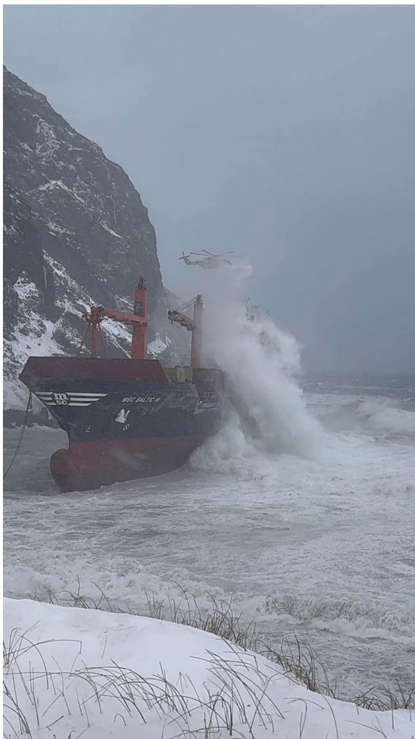
Figure 3: Container ship that was recently grounded and rescued off the coast of Corner Brook, south of Portland Creek.