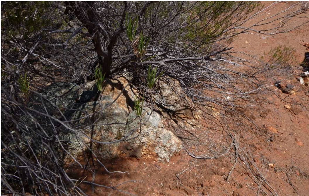
Figure 1. Detail of sub- cropping northeasterly trending lithium-rich (3.4% Li 2 O) pegmatite, Sample site 21111065.

Assay results from the reconnaissance sampling programme (Table 1) show a concentration of Tantalum and Niobium enriched pegmatites within the greenstones on tenement E30/520. Using the Nb/Ta ratio as an indicator for granite fractionation and LCT prospectivity (Steiner, 2019) 51 pegmatite samples can be described as fractionated ( Nb/Ta < 5 ) and 13 samples from the Emerald SE, Snake Hill, and 38 Mile Well areas as strongly fractionated ( Nb/Ta < 1 ).