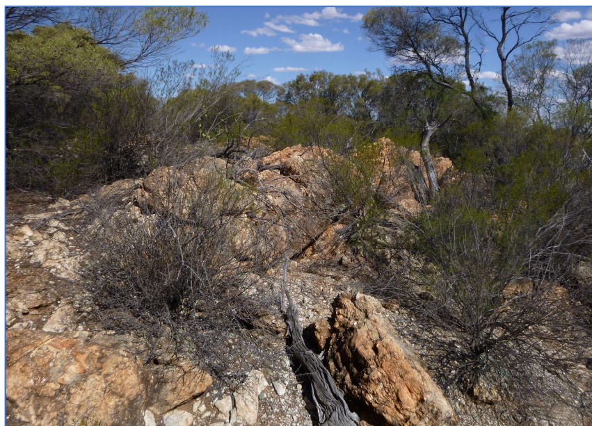
Gently north dipping pegmatite dyke. Sample site 21111077.

VMC has completed an assessment of available drilling data and received assay results for 143 rock samples that were collected during sampling of outcropping granitoids/ pegmatites and greenstone host rocks on tenements E30/520 and E29/1112 (Figure 2; Refer ASX release 27 October 2021).