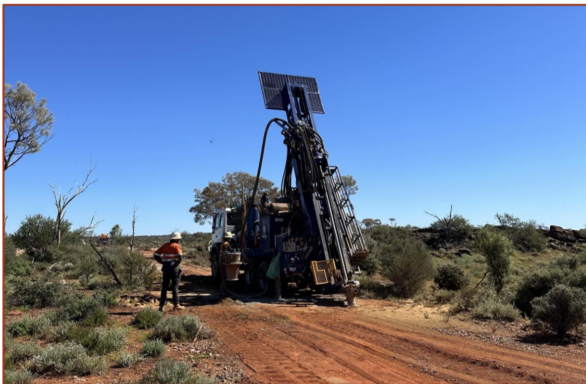
Figure 1 – Drilling at Edjudina Gold Project

M3 Mining Limited (ASX: M3M) ( M3 Mining or the Company ) is pleased to provide an update on drilling operations at the Edjudina Gold Project ( Edjudina or the Project ), located approximately 150km northeast of Kalgoorlie, WA.