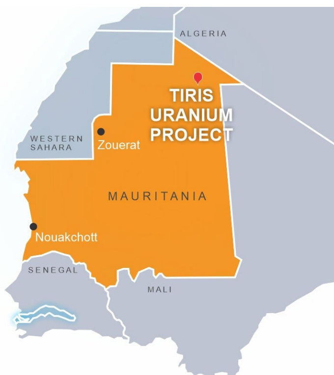
Figure 2: Location plan of the Tiris Uranium project in Mauritania, Africa

Tiris is located approximately 1,400 kilometres from the capital of Mauritania, Nouakchott. The Project is located 680km from the town of Zouérat in the Tiris Zemmour Region of Mauritania. Access is by hard pan desert track (Figure 2).