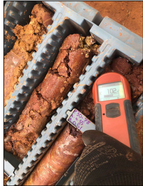
Figure 5: Magnetic susceptibility test for highly magnetised kamafugite stratigraphy