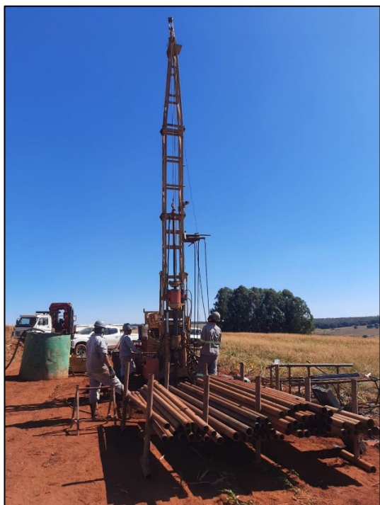
Figure 1: Diamond drill rig is in operation in Coda North

Six diamond drill holes (Figure 1) have been completed, yielding valuable core samples for further high confidence geological analysis and evaluation (Figure 2). Five RC drill holes have been completed which allowed rapid evaluation of mineralisation over a broader infill area compared to diamond drilling. The combined drilling has helped to establish the extension of mineralisation along strike and down dip.