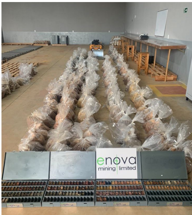
Figure 6: RC Drill sample batches prior to dispatch to laboratory

Over 500 drill samples dispatched to SGS Geosol laboratory (Belo Horizonte) await assay analysis, (see Figure 6). This is additional to samples already submitted to the laboratory over the last few weeks. Enova's exploration team is closely managing the submission process and controlling field activities. Enova will announce assay results as they become available.