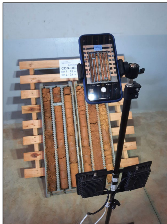
Figure 2:

Enova's exploration activities at CODA North have identified significant mineralised zones in kamafugite (Figure 3, 4, 5) lithostratigraphic units within the Patos formation, which is part of the Cretaceous Mata Do Corda Group. This discovery indicates a significant potential for valuable REE mineral resources in the area.