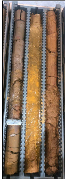
Figure 4: Saprolite zones is visible within kamafugite