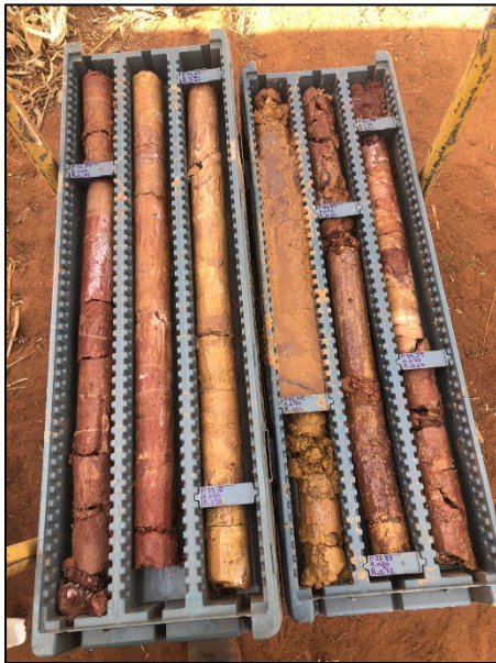
Figure 3: Significant intersection of Mineralised zone within kamafugite of Patos formation