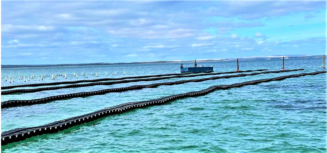
Picture 1 – Newly built 100m long FlipFarm lines in Coffin Bay ready to receive first stock in April. A total of 4Ha (~40 lines) are being developed for FlipFarming trials in Coffin Bay. The floating system will increase operating efficiencies and improve accessibility. (In the background, to the left, is existing intertidal-farm infrastructure submerged during high-tide.)

The on-water construction activities for FlipFarms, which is managed in-house, have commenced and the project is on track to be delivered on budget and on schedule.