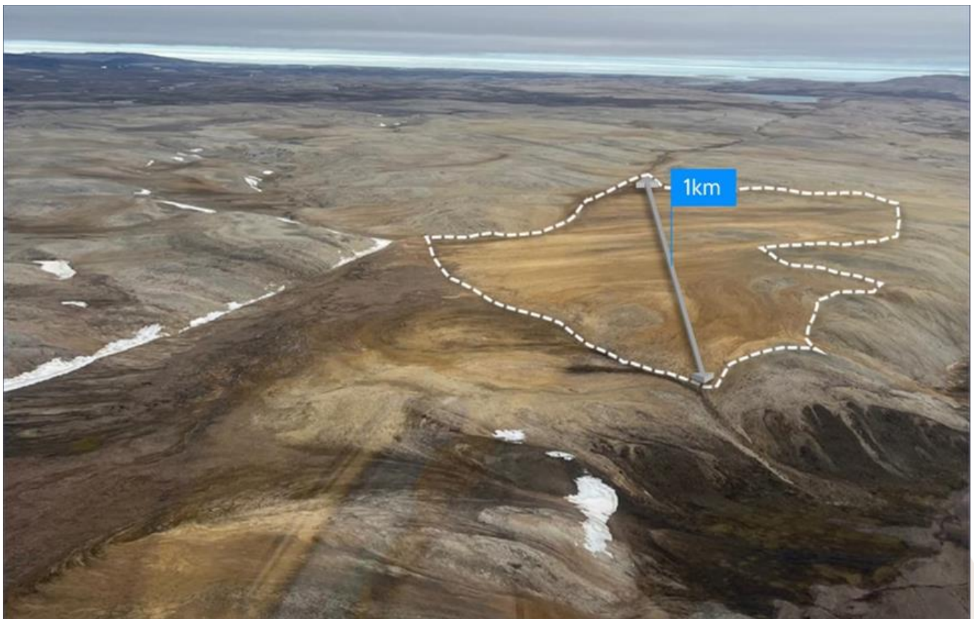
Figure 2: Miguel gossan as viewed from a helicopter.

Extensive hydrothermal alteration, including dolomitisation and quartz veining was observed, particularly around the large gravity anomaly further to the south (Figure 3). Dolomitisation is a common alteration style observed in both sedimentary-hosted copper and Mississippi Valley-Type (MVT) deposits. This alteration style was extensive at the Miguel prospect and suggests significant hydrothermal fluid activity, possibly related to a large mineralised system.