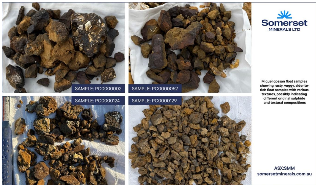
Figure 1: Newly discovered gossans from the Miguel prospect 1

The Miguel prospect contains dolostones and carbonates similar to those hosting the neighbouring Storm deposit, which is located 29 km to the east. Four gossan-bearing locations have subsequently been identified at surface, consisting of rusty, vuggy, siderite-rich float samples with various textures, possibly indicating different original sulphide compositions and textures (Figure 1).