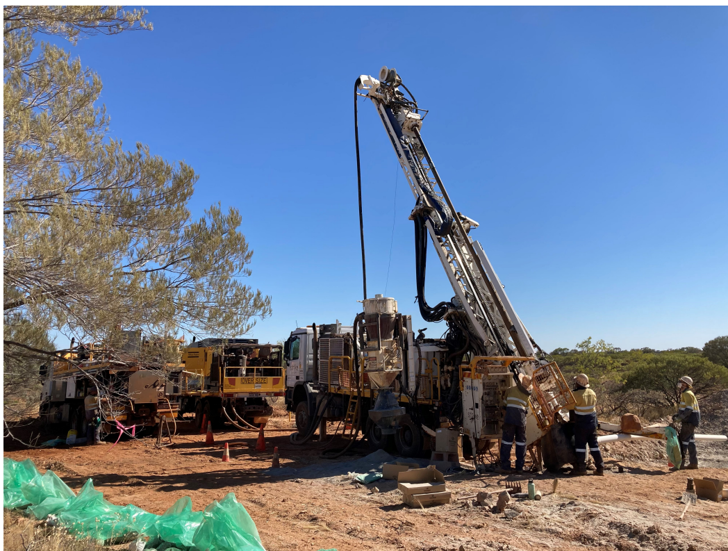
Figure 1: RC drill rig at Four Corners prospect

Dalaroo Metals Ltd (“DAL” or “Company”) is pleased to provide an update on exploration activities at the Lyons River Project (“Lyons River” or “Project”), where a program of RC drilling has begun at the Four Corners prospect (Figure 1 and 2). Lyons River comprises a strategic (100% owned) land position of 703 km 2 within the Proterozoic Mutherbuckin Zone of the Gascoyne Province. The Company believes the district is an emerging Broken Hill Type (“BHT”) / Sedimentary Exhalative (“SEDEX”) deposit setting.