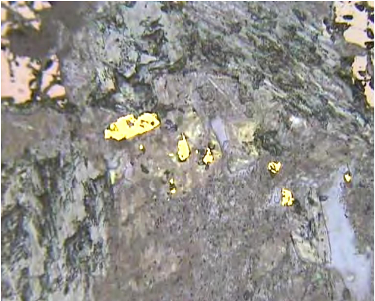
Figure 2: photomicrograph of sample 1370002.20 from 1,295.2 metres, showing fine grained chalcopyrite intergrown with secondary propylitic-style alteration minerals. Whilst only present in trace quantities, the importance of the intergrowth of chalcopyrite with distal porphyry-style late magmatic/hydrothermal stage alteration minerals is that it suggests that the parent intrusion (the source of these QDP dykes) is fertile (ie, enriched in metals, sulphur and water) and has produced a late stage metal and sulphur-rich fluid of the kind which can form copper and/or gold enriched zones.

Detailed petrographic studies of numerous samples have also confirmed that the copper occurs as disseminated fine grained chalcopyrite intergrown with other secondary alteration minerals including chlorite, amphibole, epidote, pyrite, magnetite, albite and hematite (see Figure 2). This assemblage indicates that the chalcopyrite formed from late hydrous magmatic to early prograde hydrothermal fluids, which is consistent with how porphyry copper mineralisation is typically formed.