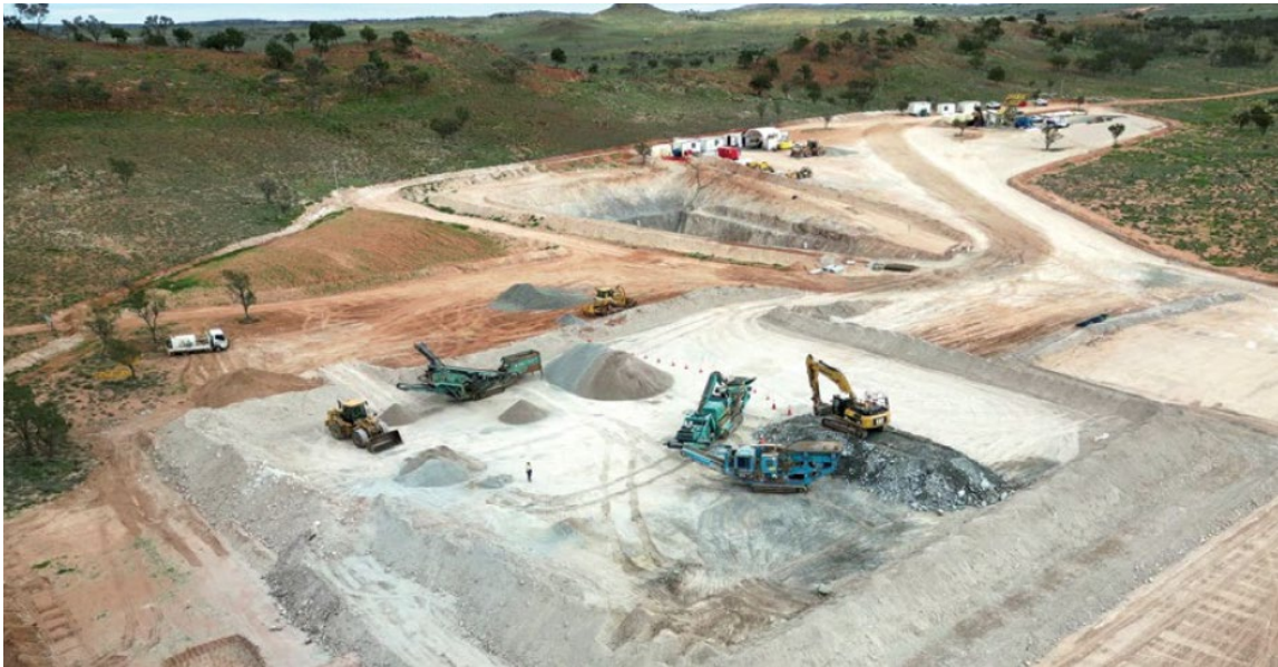
Crushing plant processing ore stockpile in preparation for milling