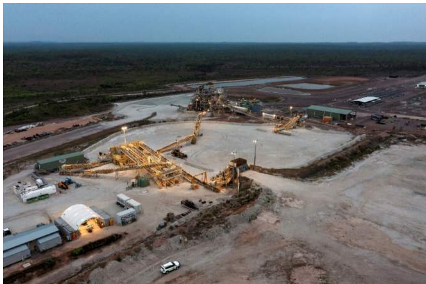
Figure 1 Grants processing infrastructure

A restart decision remains subject to the outcomes of the Restart Study, market conditions, and the approval by the Company's Board for the Final Investment Decision.