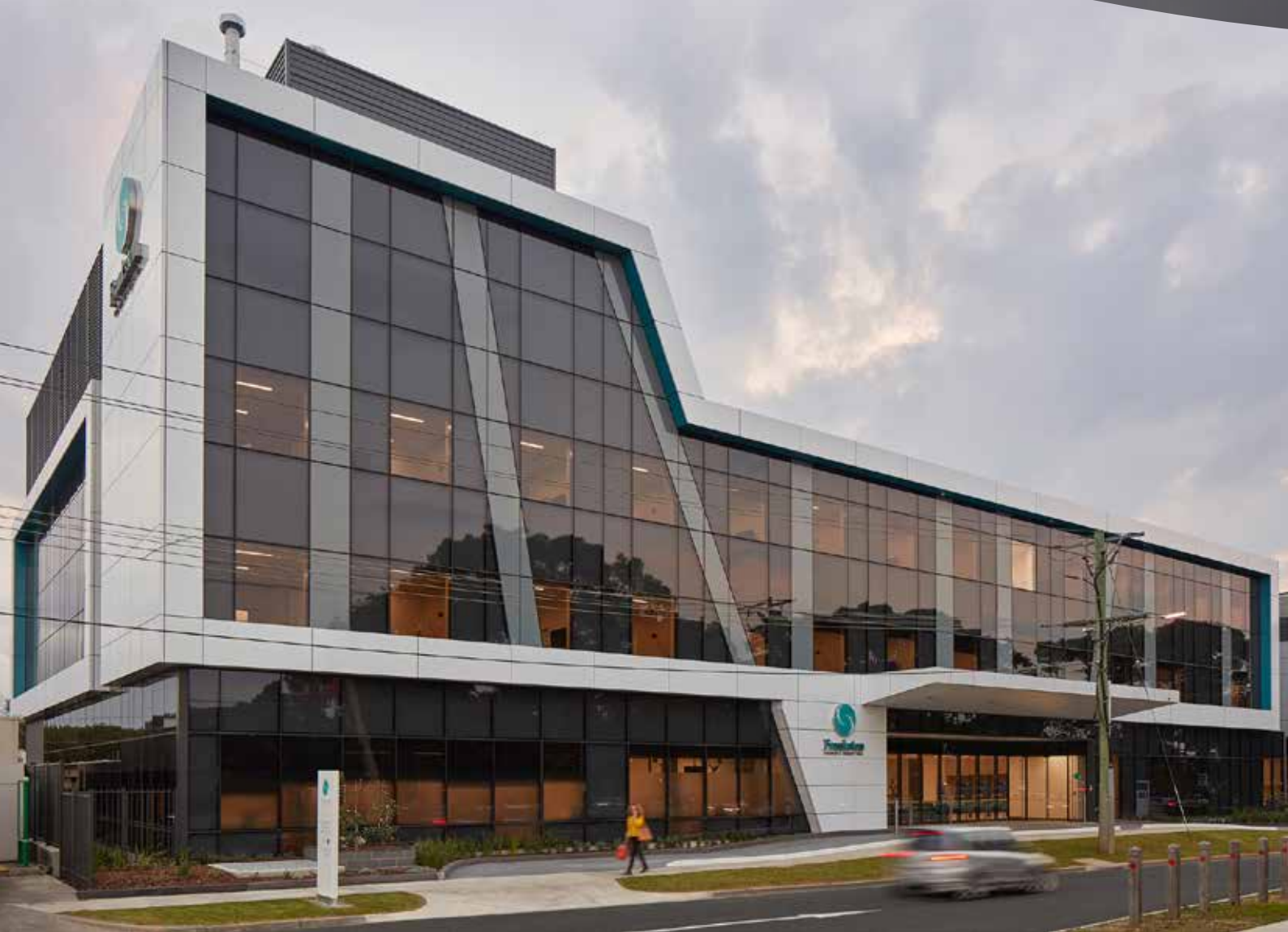
Frankston Private Hospital

Completion of the Frankston Private Hospital expansion is on track for the coming weeks. The major expansion project required construction of a new building adjacent to the existing hospital which now serves as the main entry to this high quality cancer treatment facility. An additional 60 beds have been delivered through the expansion, with the refurbishment of the existing hospital now also complete. The expansion has provided three extra operating theatres, an expanded Central Sterile Services Department and a new day oncology unit, with the existing day oncology unit converted into a second stage recovery unit.