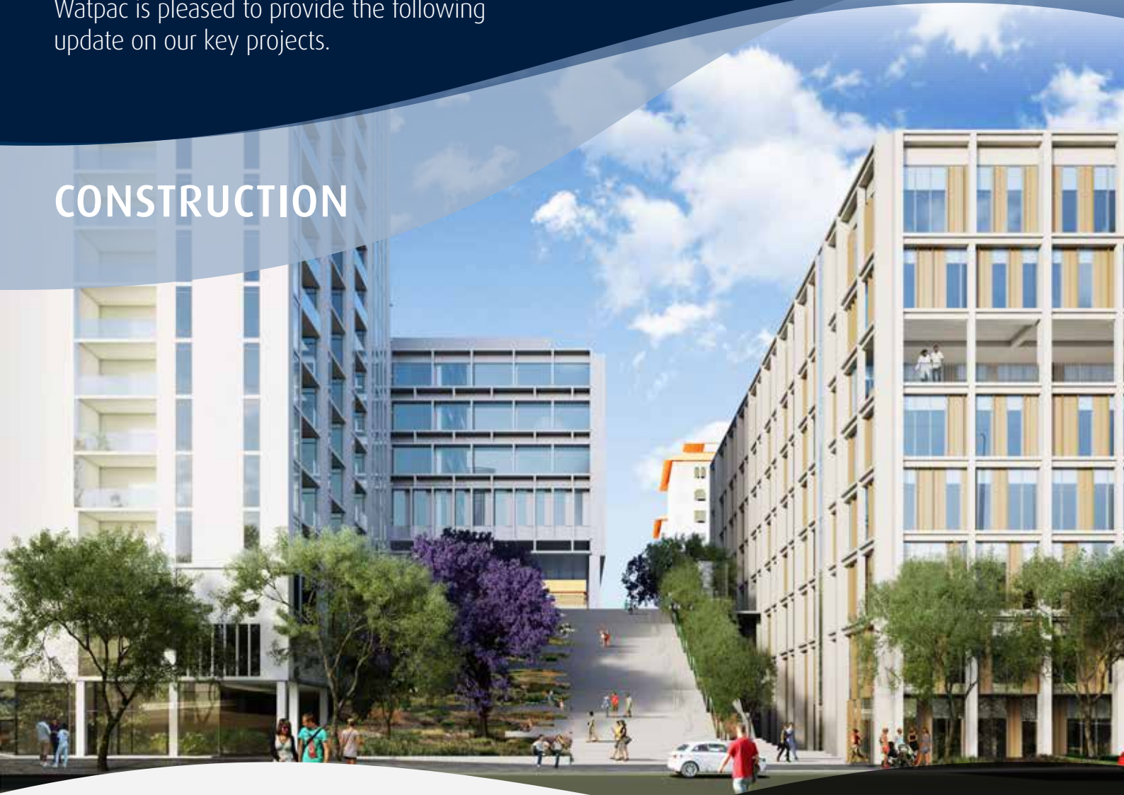
Herston Quarter Redevelopment