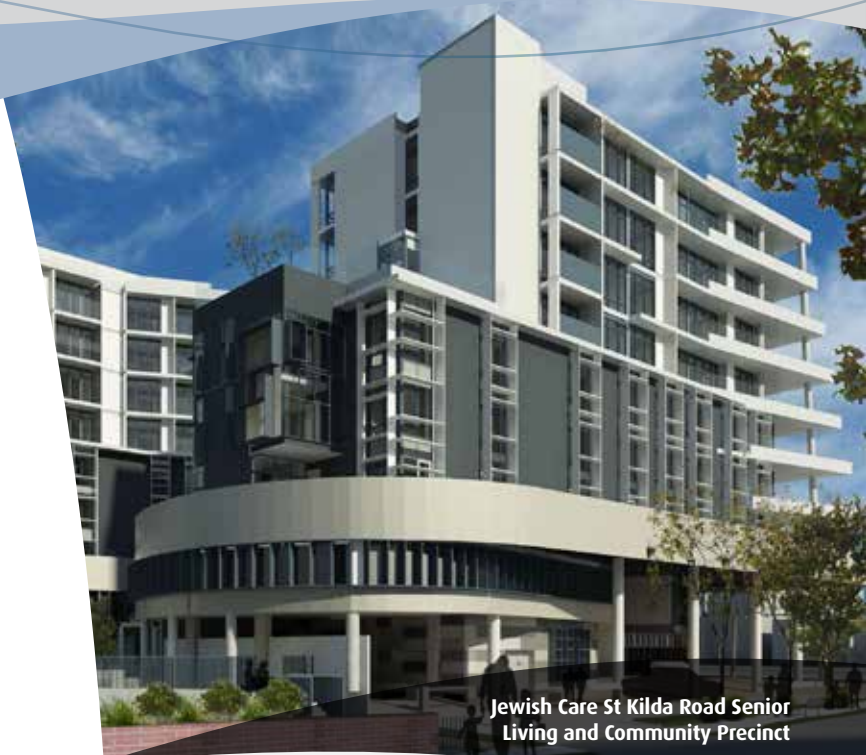
Jewish Care St Kilda Road Senior Living and Community Precinct

Watpac was awarded the contract to build Jewish Care Victoria's Senior Living and Community Precinct in Melbourne in May 2017. Construction recently commenced for this multi-phase development that will transform the existing site into a state-of-the-art aged care facility for Melbourne's Jewish community. With 156 residential units, relevant health care and medical services, the new nine-storey building will also include associated retail and commercial areas and basement car parking. The development will also provide facilities for residential religious services including a synagogue and communal kosher kitchens with adjacent dining areas.