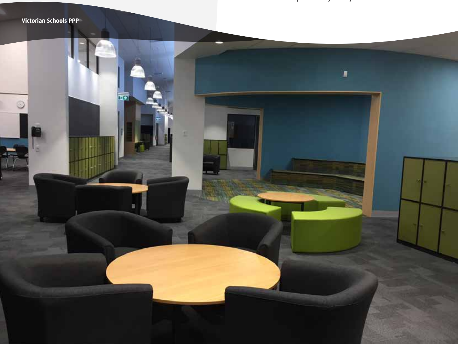
Victorian Schools PPP

As part of the Learning Communities Victoria consortium, Watpac is delivering 15 new schools for the Victorian State Government's New Schools PPP Project. The project includes the construction and maintenance of primary, secondary and special schools, in addition to some community facilities. Construction of the Tranche 2 schools at Armstrong Creek, North Geelong, Bannockburn and Torquay North are progressing well with building façades, the roof and the services rough-in works almost complete. The next phase of internal finishes are about to commence and plasterboard works are well progressed. Externally, carpark and landscaping works have commenced, and civil construction works have been completed. Drainage works on the sports grounds are also underway. Building works are expected to be finished in late September 2017, with the project on target for contract completion in January 2018.