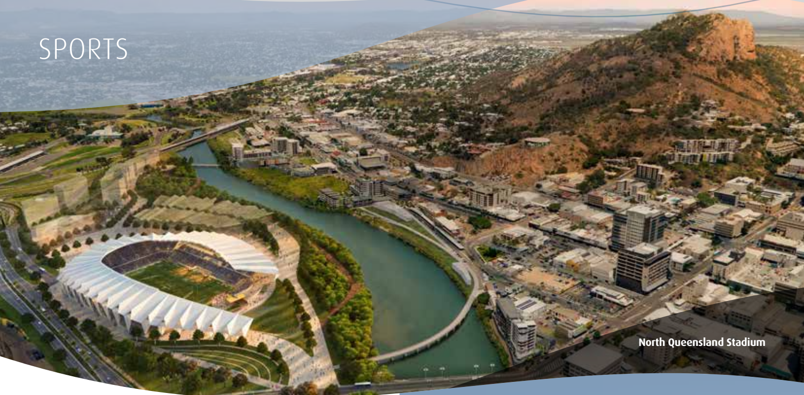
North Queensland Stadium